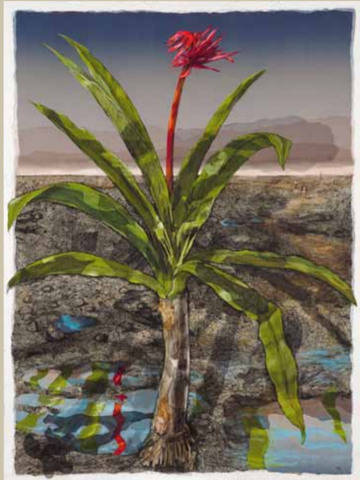
Untitled XIII, 2016