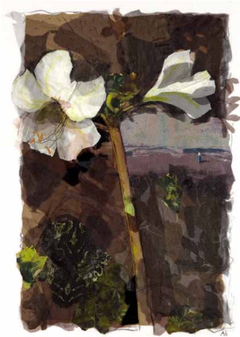
Amaryllis III , 2016 Cloth painting and drawing 23 x 16" image, 29 x 21" linen AC371