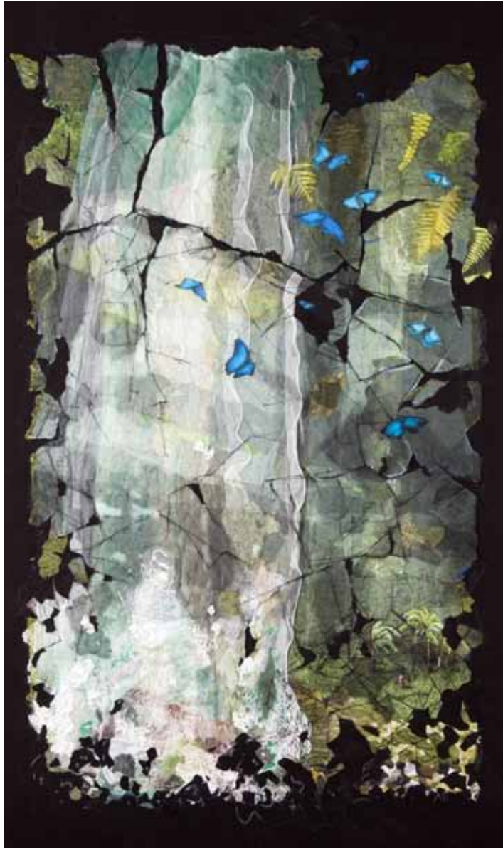
In the Corner , 2015 Cloth painting and drawing 54 x 30" image, 58 x 34" linen AC366