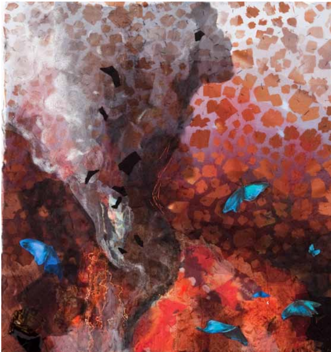
Untitled XII , 2015 Cloth painting and drawing 21 x 20" image, 27 x 25" linen AC367