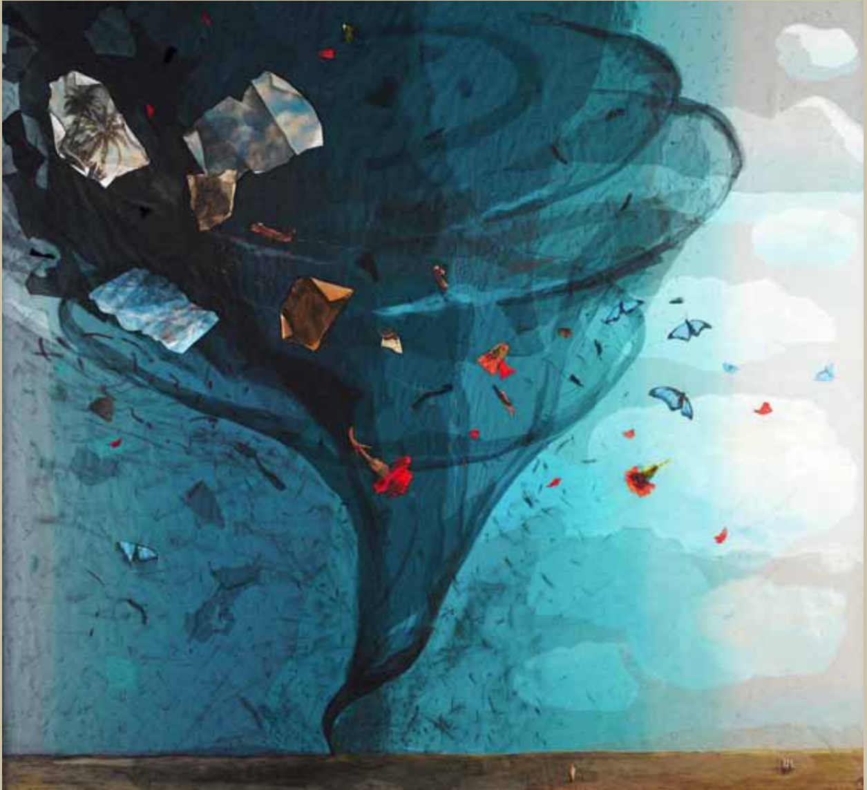
Out of the Blue , 2015 Cloth painting and drawing 52 x 49" image and linen AC364