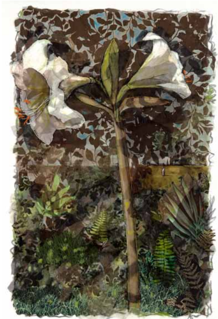
Amaryllis I , 2016 Cloth painting and drawing 23 x 16" image, 29 x 21" linen AC369