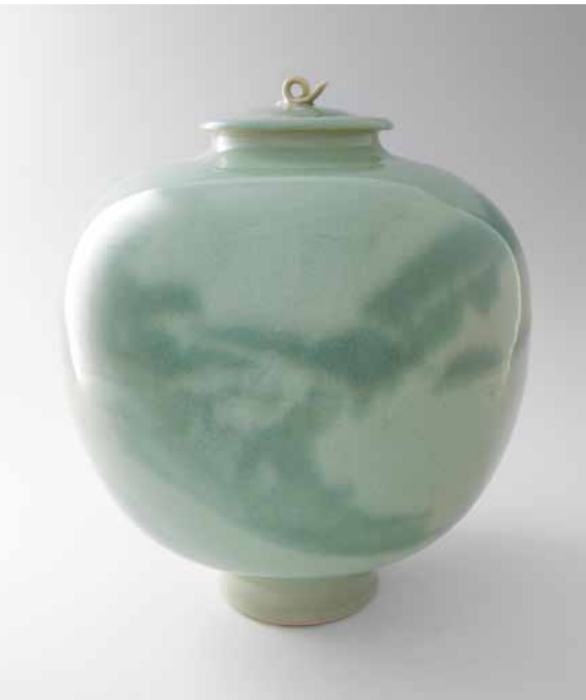
VASE WITH LID tender green celadon glaze 13.25 x 13 x 13" TH759B