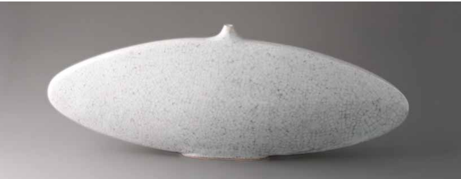
ELLIPTICAL VASE ice crackle glaze 10 x 25.25 x 3" TH714