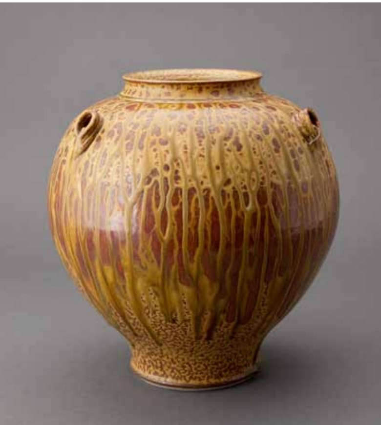
VASE elm ash glaze 12 x 11 x 11" TH1604