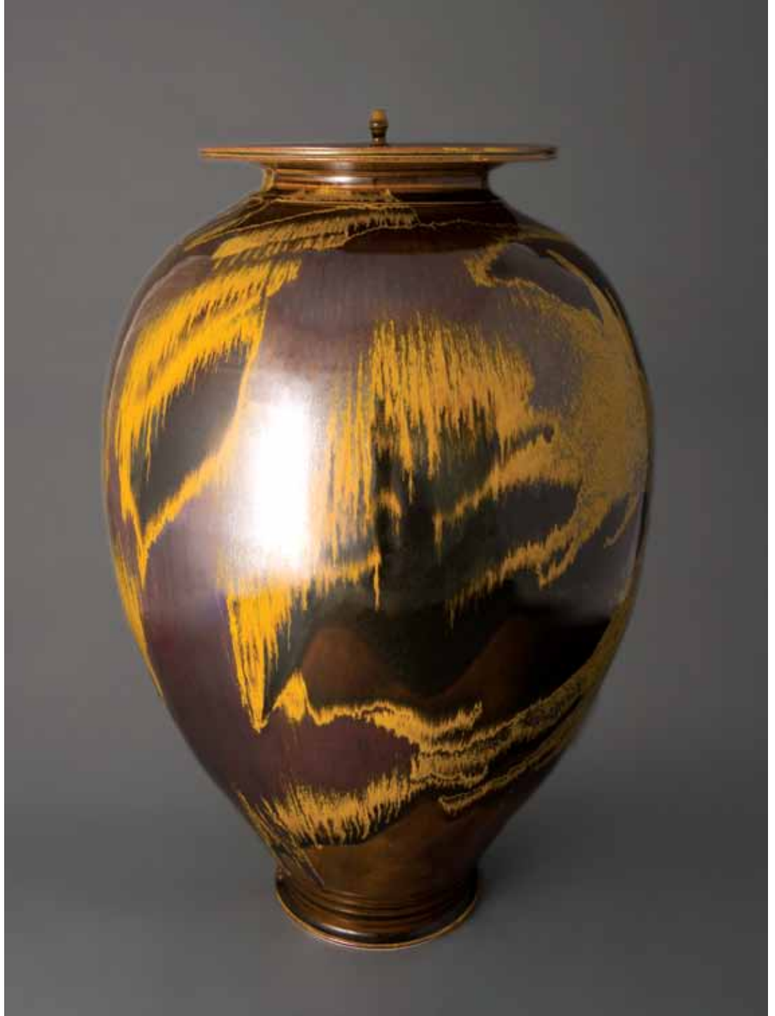
VASE WITH ALTERNATE LIDS iron yellow glaze 24 x 15 x 15" TH1234B