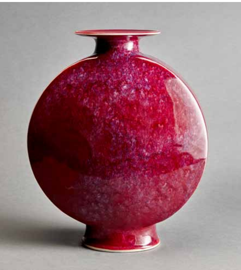
CANTEEN VASE copper red and purple glaze 19 x 16 x 8" TH849B