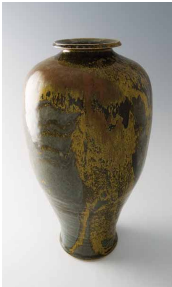
TALL VASE celadon and iron yellow glaze 17.25 x 9 x 9" TH1532B