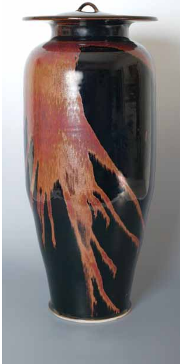
VASE WITH LID honan tenmoku glaze 21.5 x 9.25 x 9.25" TH898B