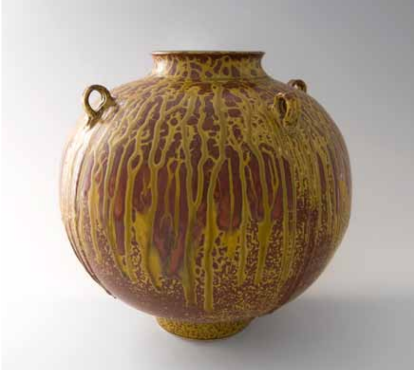
VASE WITH LUGS elm ash glaze 13 x 13 x 13" TH1357B