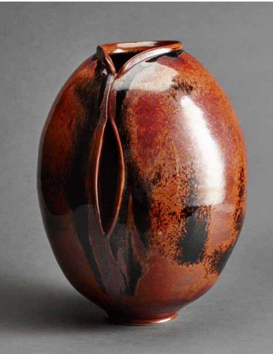
VASE rust and black glaze 18 x 13.5 x 13.5" TH1888