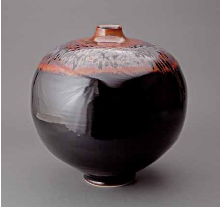
VASE mirror black glaze with partridge feathers 17.75 x 17.5 x 17.5" TH1238B