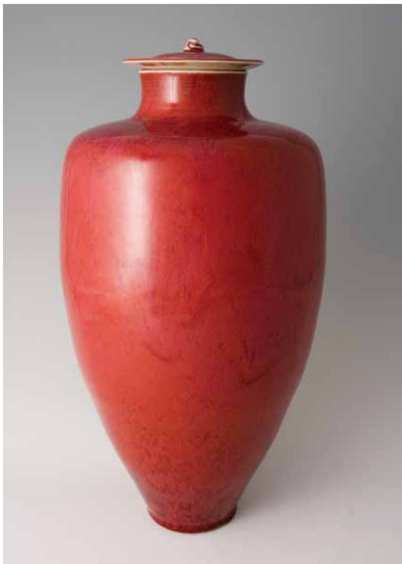
VASE WITH LID rose red copper glaze 17.25 x 9.25 x 9.25" TH853B