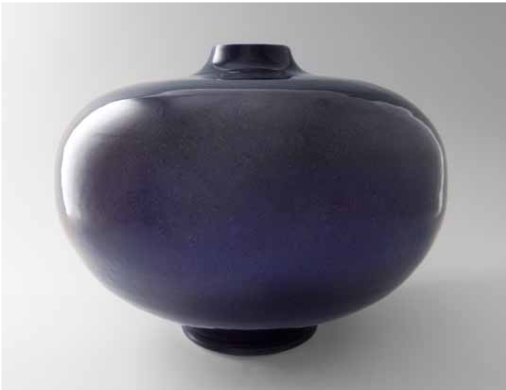
VASE night sky blue glaze 12 x 15.75 x 15.75" TH1739B