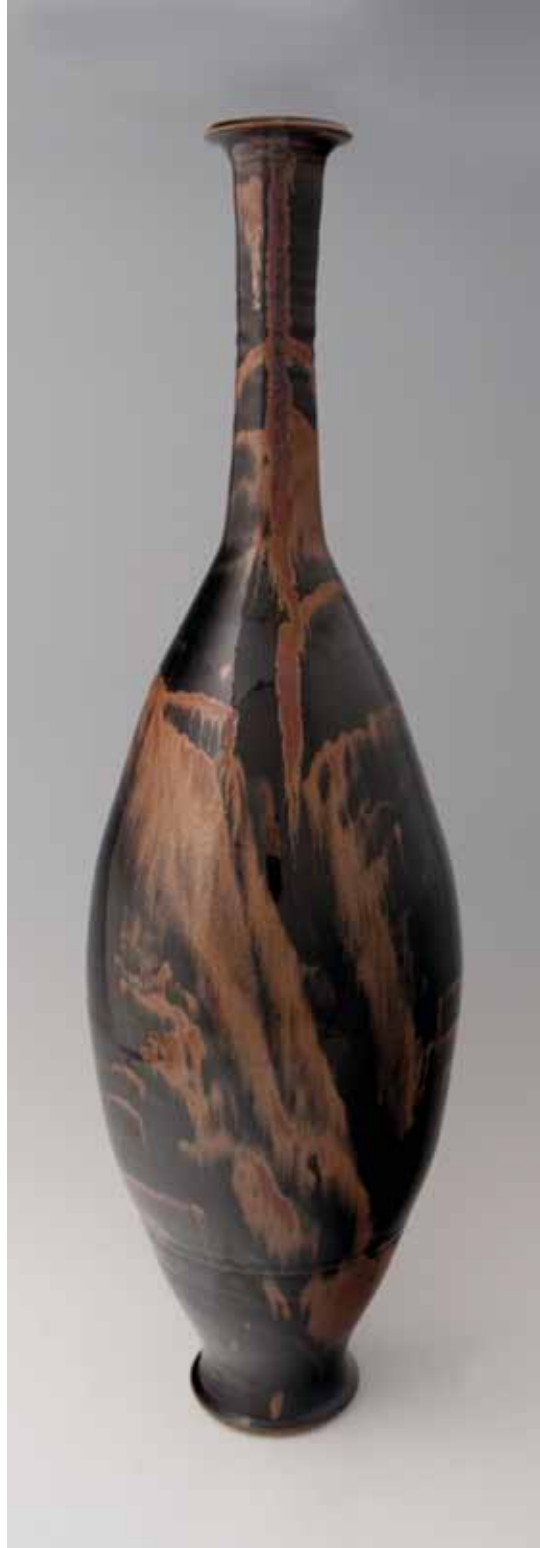
TALL VASE honan tenmoku glaze 31.5 x 9.25 x 9.25" TH806B