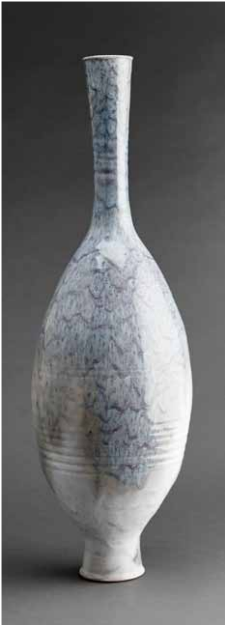
TALL VASE chrysanthemum glaze 30.75 x 8.75 x 8.75" TH851B