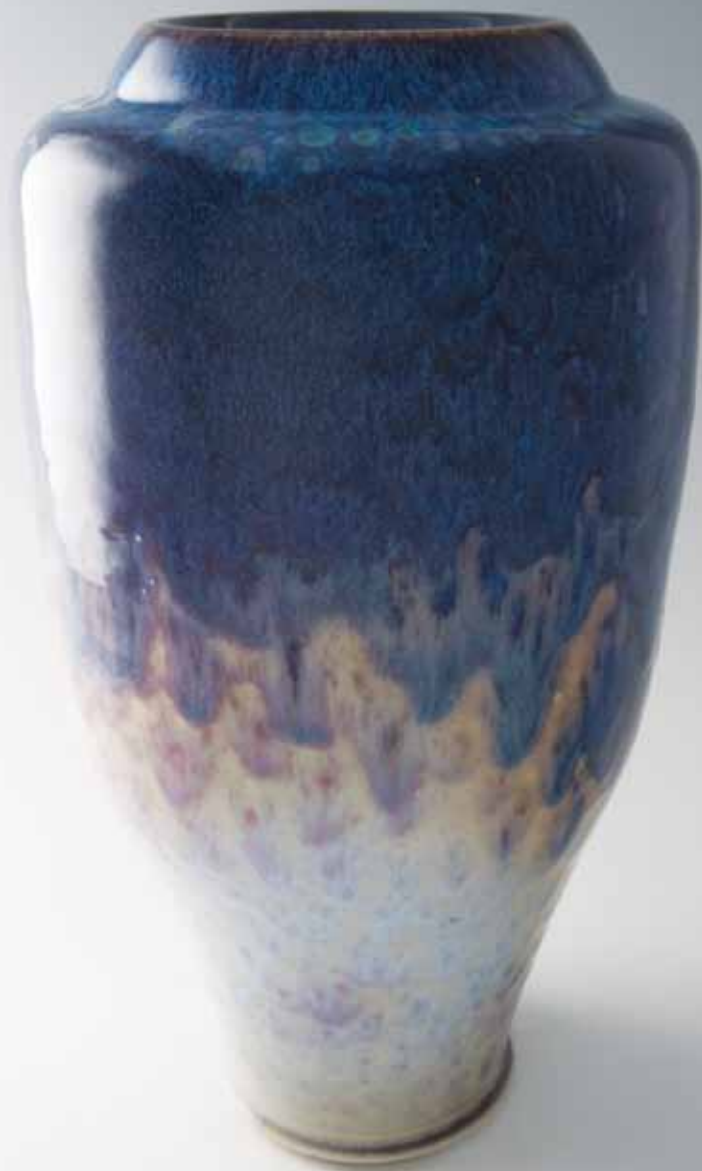
TALL VASE WITH LID copper blue on opal white glaze 17.75 x 8.75 x 8.75" TH682B