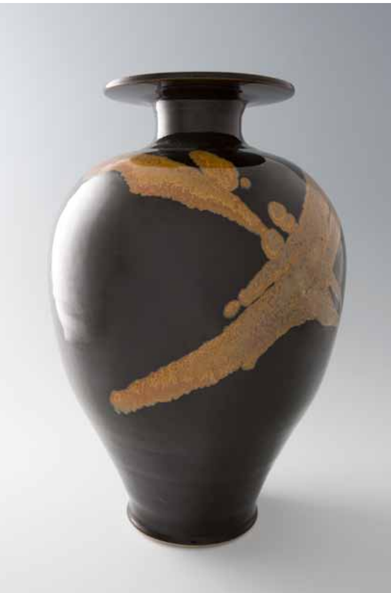
TALL VASE tenmoku and crystalline rutile glaze 17.5 x 11.5 x 11.5" TH2037B