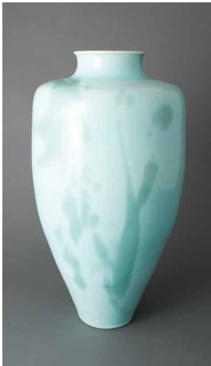
VASE turquoise and green copper glaze 17 x 9.25 x 9.25" TH712B