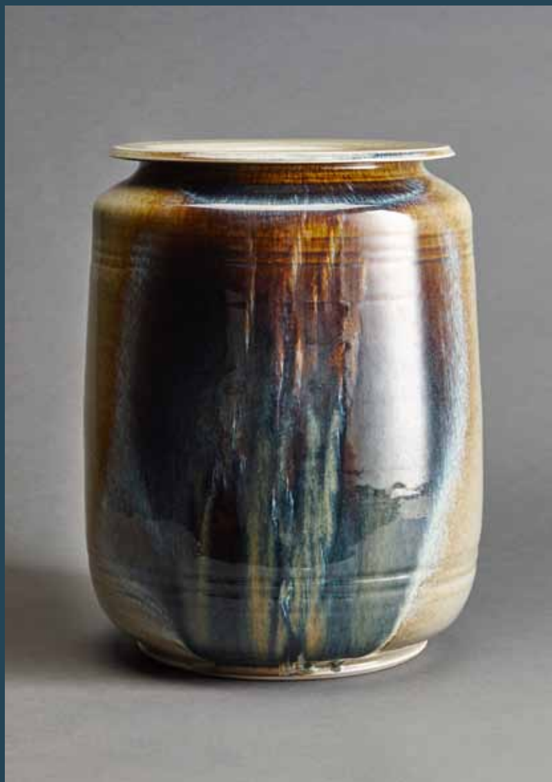
JAR spruce ash celadon glaze 15.5 x 12 x 12" TH497B

Pucker Gallery is a member of the Boston Art Dealers Association and the New England Appraisers Association.