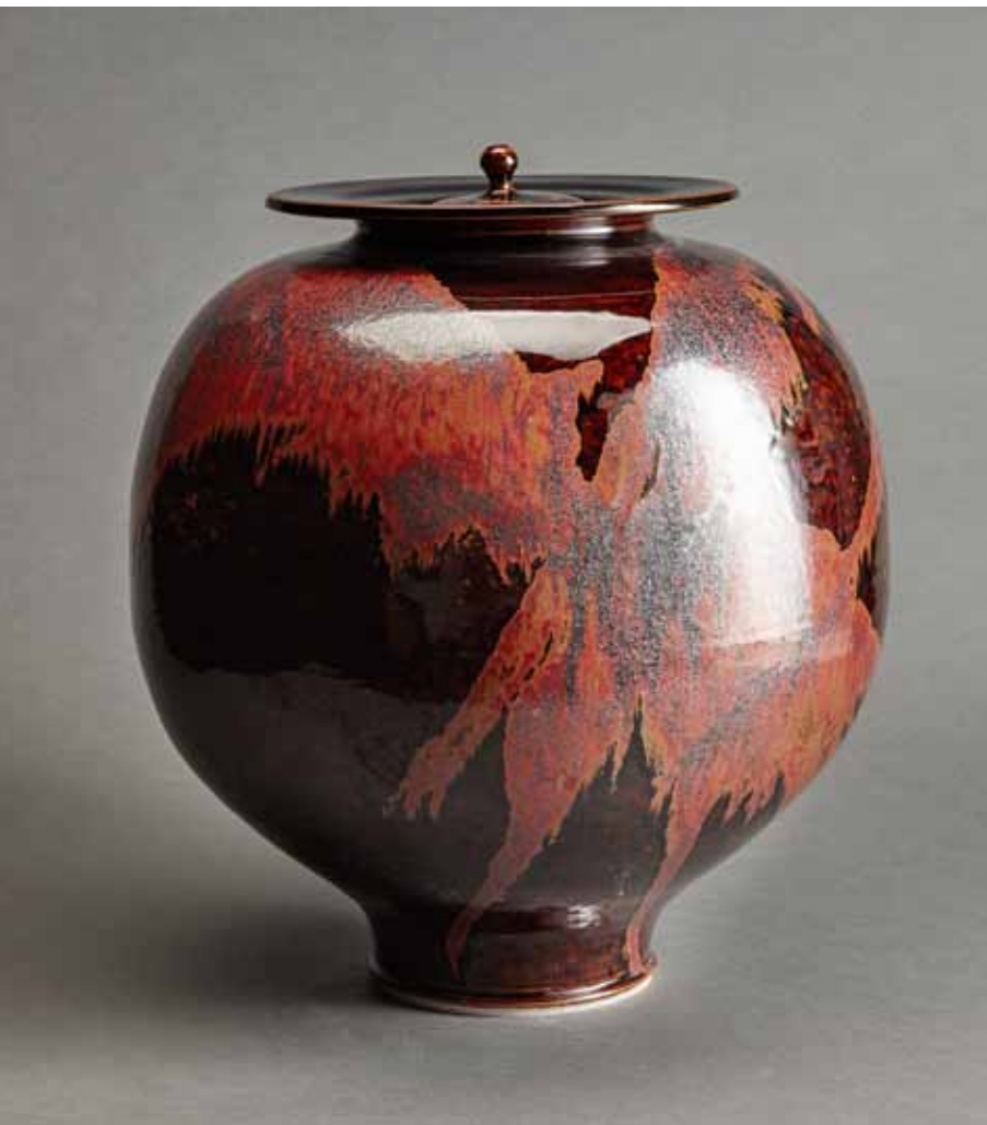
VASE WITH LID honan tenmoku glaze 17.5 x 15.5 x 15.5" TH1352B