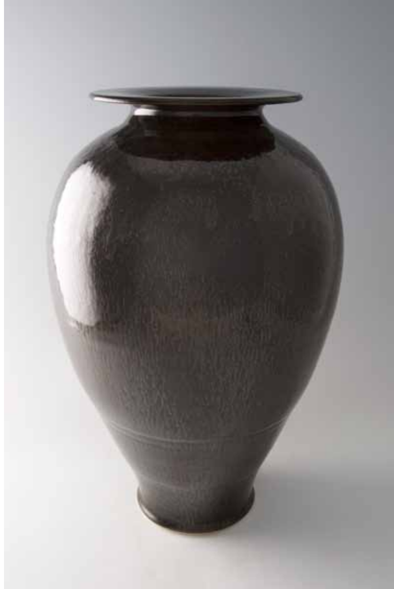
TALL VASE oil spot glaze 19 x 11.75 x 11.5" TH1748B