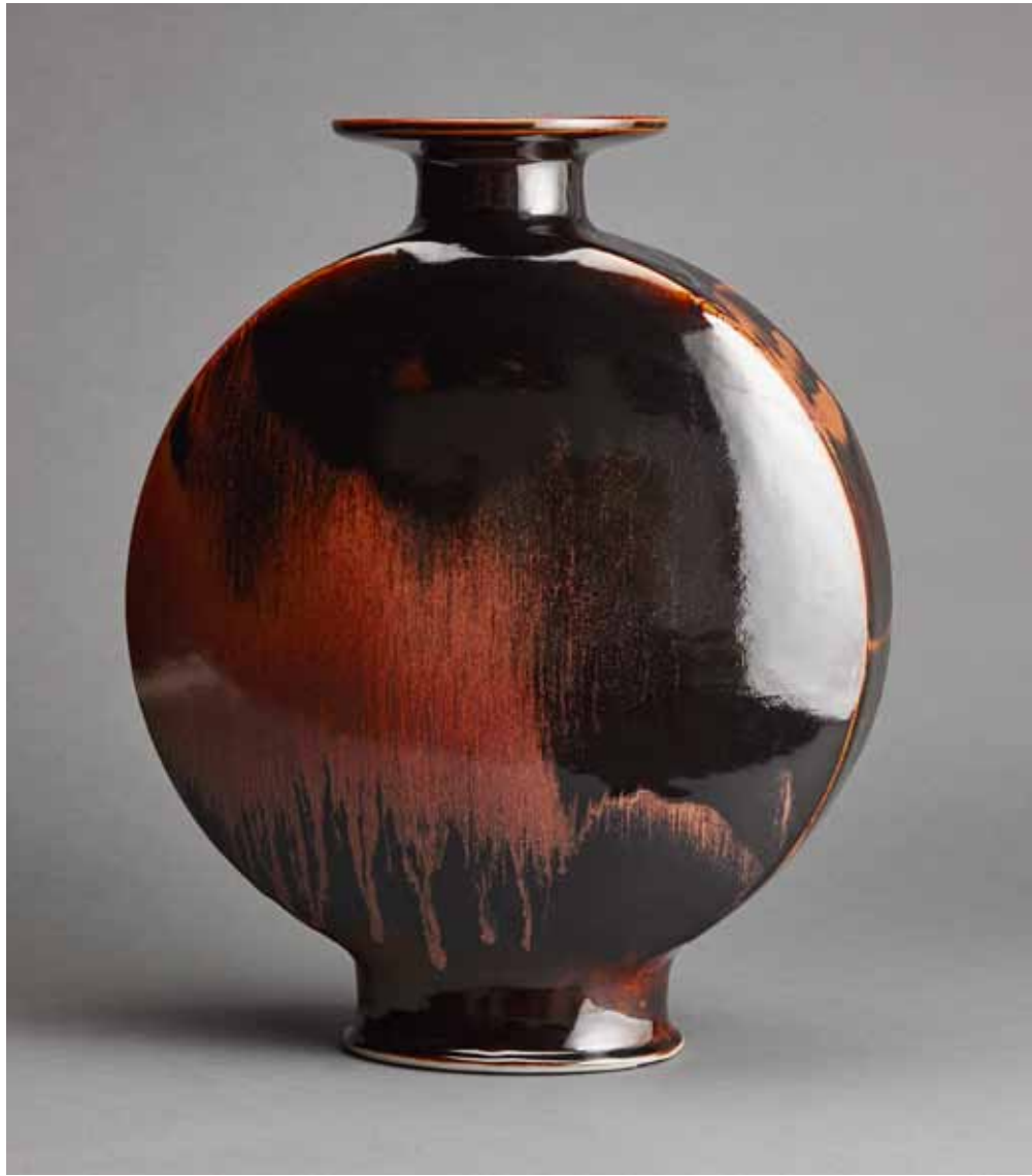
CANTEEN VASE honan tenmoku glaze 18.25 x 15.25 x 7.25" TH850B