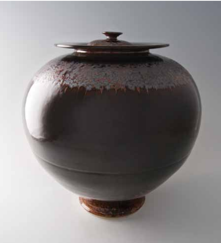
VASE WITH LID mirror black glaze with bindi 16.25 x 14 x 14" TH1852