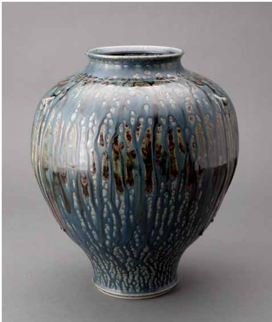
VASE blue elm ash glaze 13.5 x 11.75 x 11.75" TH1627B