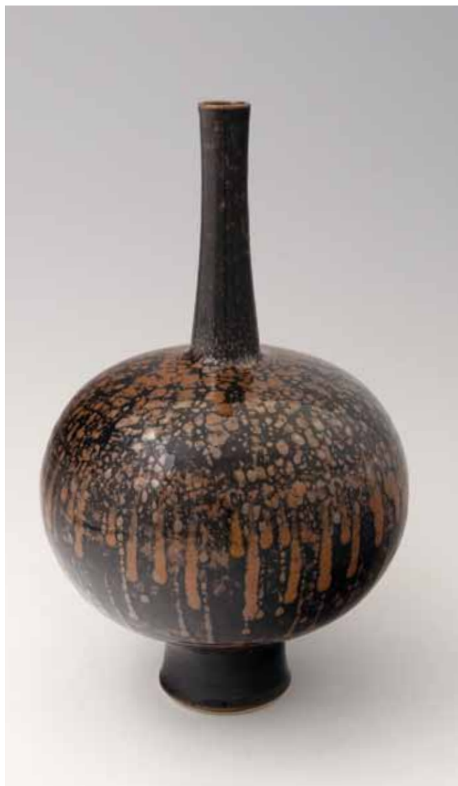
VASE WITH LONG NECK tenmoku and kaki glaze 15.5 x 9 x 9" TH1297(JH)