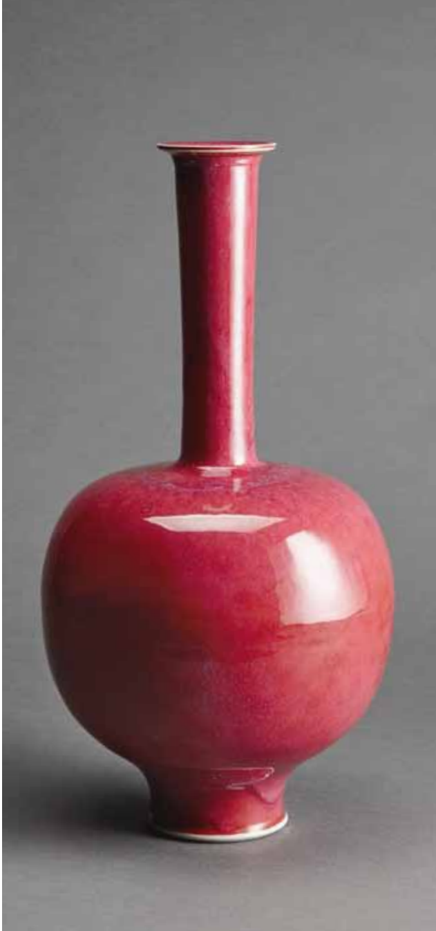
VASE WITH LONG NECK rose red copper glaze 18.25 x 9 x 9" TH852B