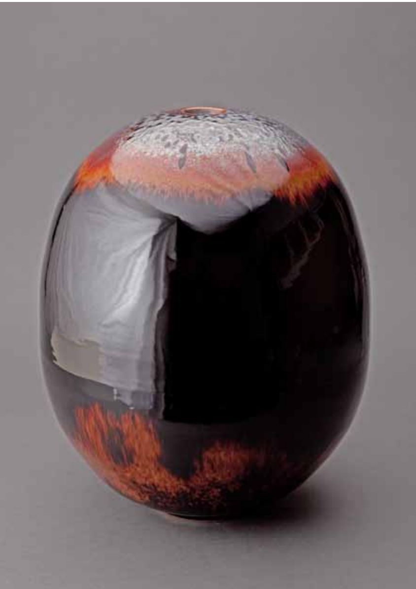
EGG VASE mirror black glaze with partridge feathers 19 x 14.25 x 14.25" TH1237B