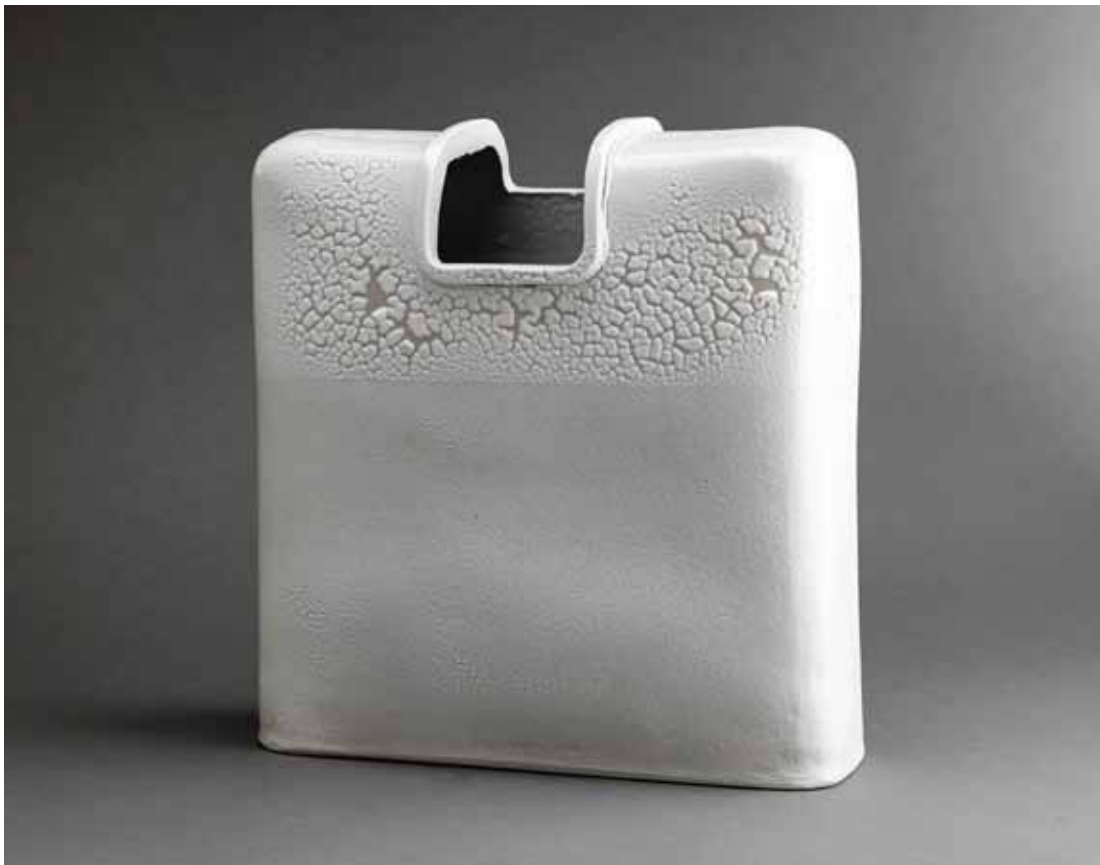
RECTANGULAR VASE kairagi glaze 17.75 x 16.75 x 7" TH2097B