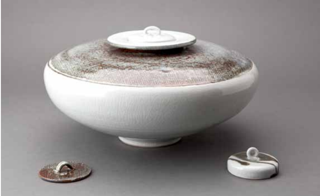
VASE WITH ALTERNATE LIDS textured ice crackle glaze 8.25 x 16.5 x 16.5" TH1124B