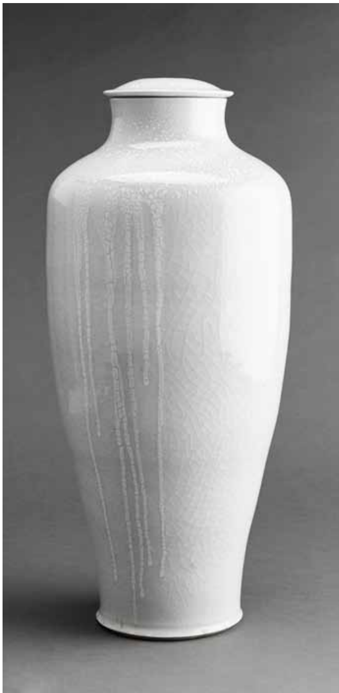
VASE WITH LID white ice crackle and copper red glaze 20 x 8.75 x 8.75" TH812B