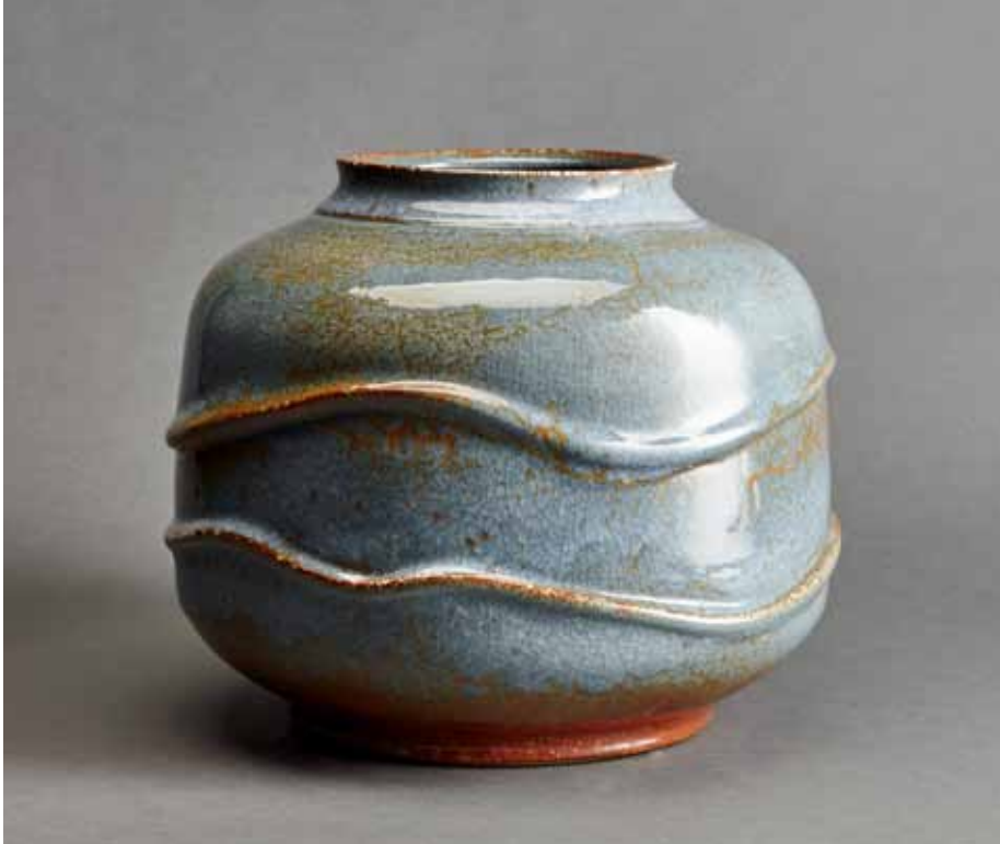
VASE blue koke glaze 12.25 x 13.25 x 13.25" TH1886B