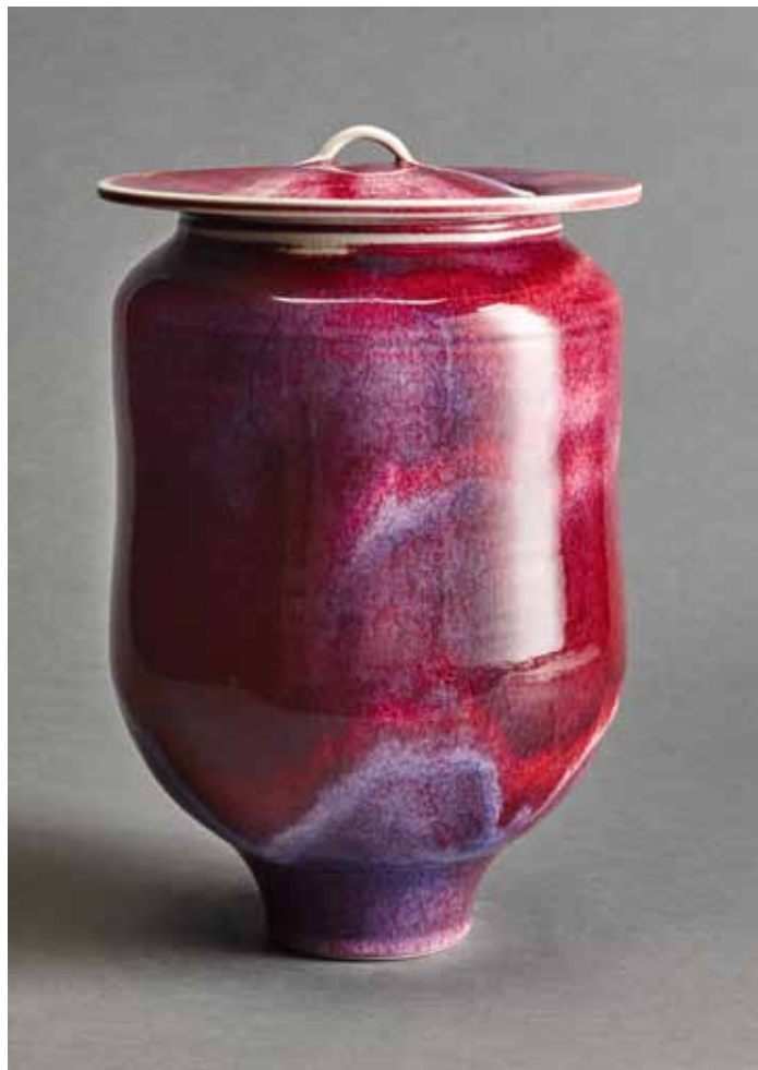
VASE WITH LID rouge flambé glaze 15 x 9.75 x 9.75" TH1173B