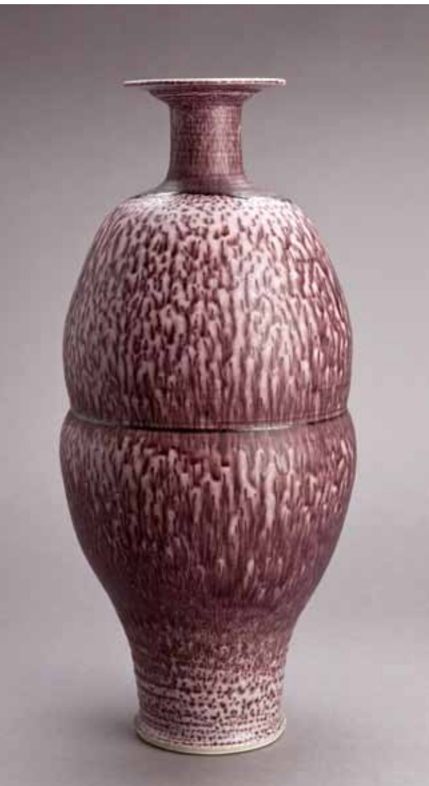
VASE textured nickel glaze 21 x 9 x 9" TH901B