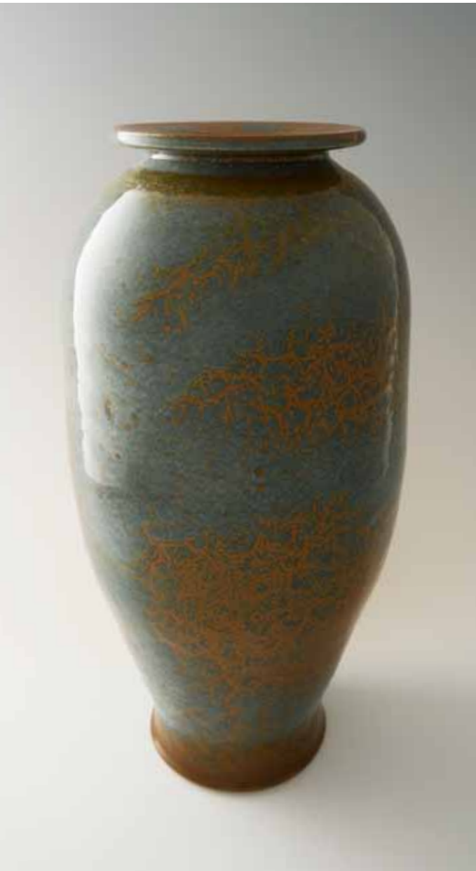
TALL VASE celadon and rust red glaze 18.75 x 9.25 x 9.25" TH1855B