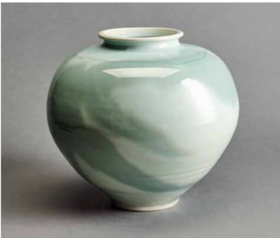
VASE tender green celadon glaze 13.5 x 13.75 x 13.75" TH1743