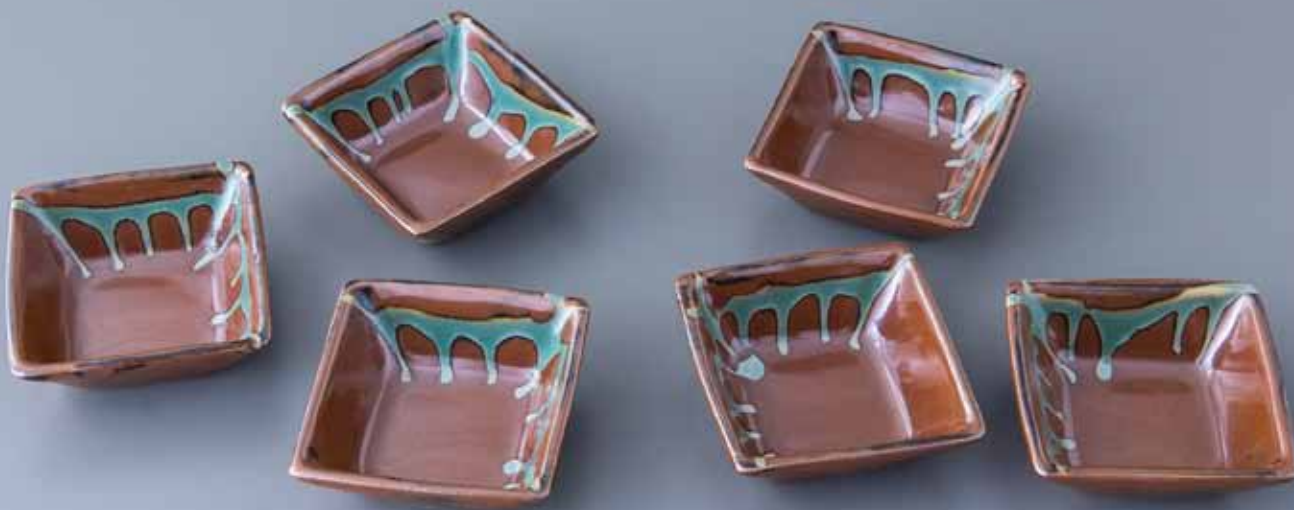
Set of six square plates kaki glaze 1 x 4.25 x 4.25" each YH572