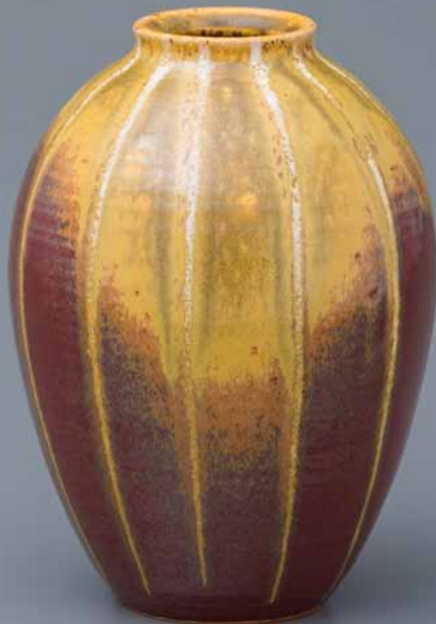
Yohen vase yellow kaki glaze 7.25 x 5.25 x 5.25" YH495