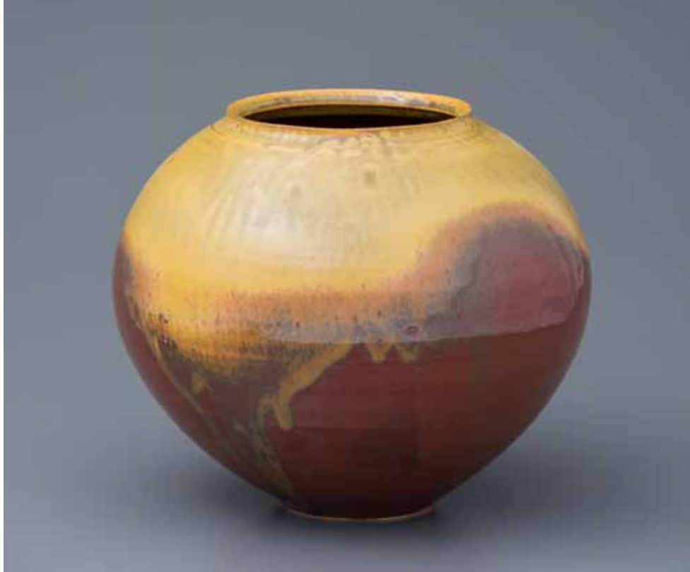
Yohen vase yellow kaki glaze 11 x 13.5 x 13.5" YH484