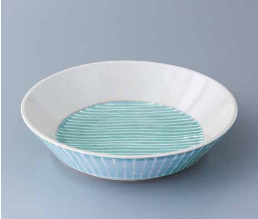
Bowl blue nuka glaze 3.75 x 16.25 x 16.25" YH505