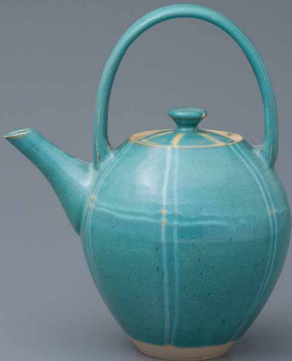
Teapot blue nuka glaze 13.5 x 9.75 x 8.25" YH502