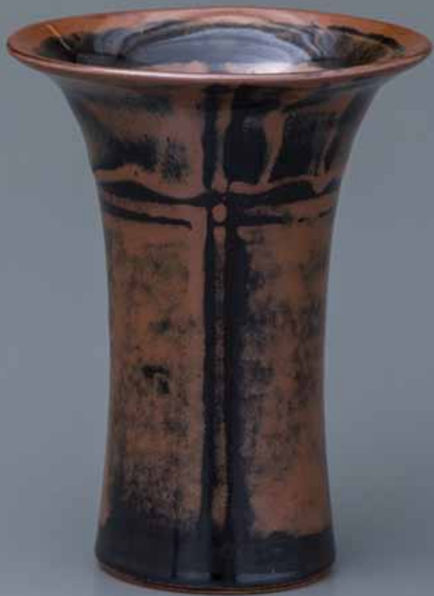
Vase kaki glaze 8.5 x 6.75 x 6.75" YH496