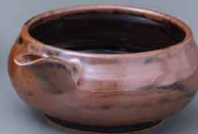
Right: Katakuchi (pourer) kaki glaze 2.25 x 5 x 6" YH564