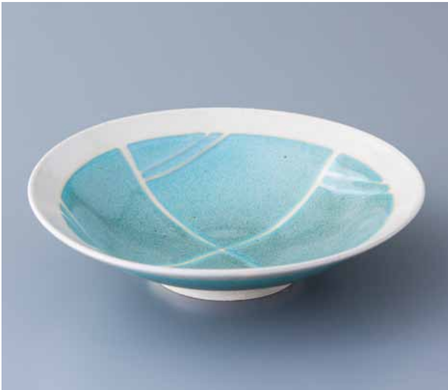
Bowl blue nuka glaze 2.5 x 9.5 x 9.5" YH519