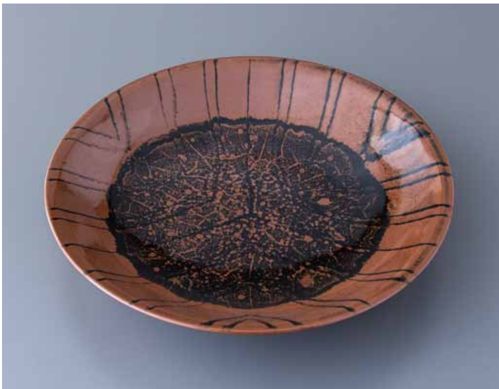
Plate kaki glaze 3.25 x 19 x 19" YH507