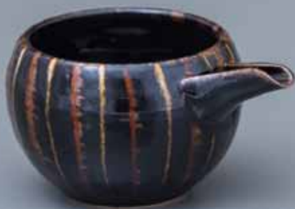
Left: Katakuchi (pourer) black glaze 3 x 5 x 5.25" YH563