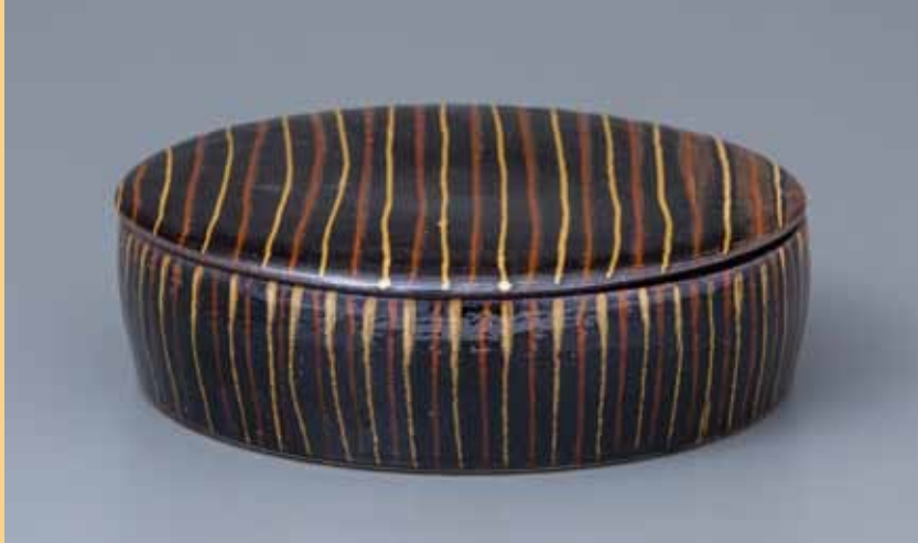
Lidded container black glaze 3.5 x 12 x 12" YH552