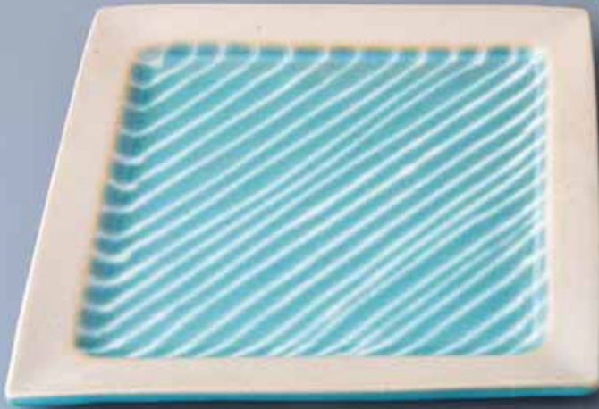
Left: Square plate blue nuka glaze 1.25 x 9 x 9" YH539