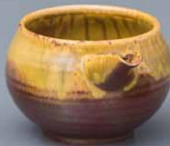
Center: Yohen katakuchi (pourer) yellow kaki glaze 3 x 4.75 x 5.75" YH562