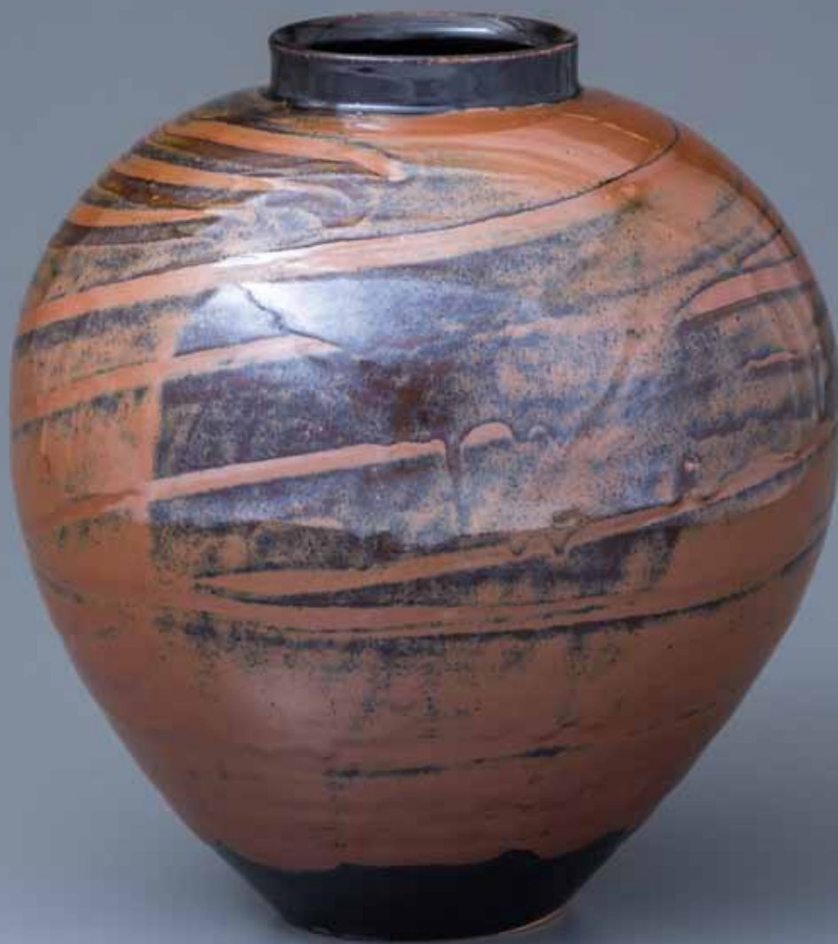
Vase kaki glaze 11.25 x 10.5 x 10.5" YH490