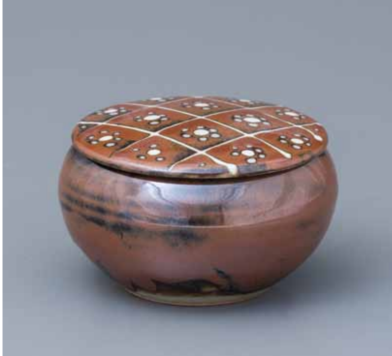
Lidded container kaki glaze 3 x 5 x 5" YH597