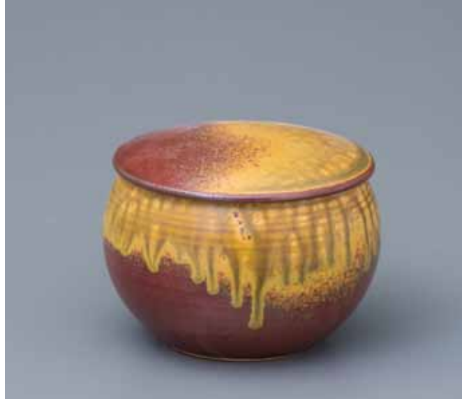
Yohen lidded container yellow kaki glaze 4 x 5 x 5" YH593