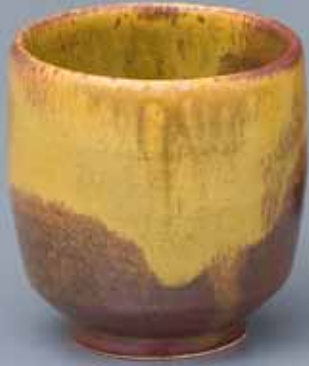
Left: Yohen teacup yellow kaki glaze 3.5 x 3.25 x 3.25" YH567