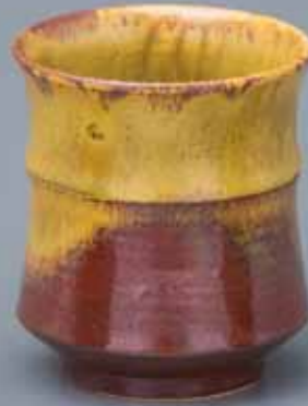
Center: Yohen teacup yellow kaki glaze 3.75 x 3.25 x 3.25" YH568