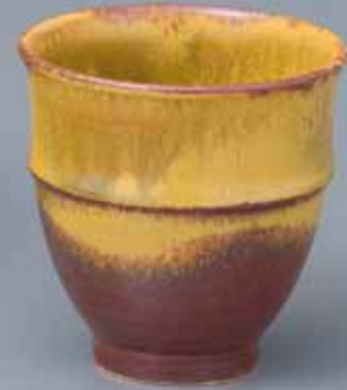
Right: Yohen teacup yellow kaki glaze 3.25 x 3.25 x 3.25" YH569