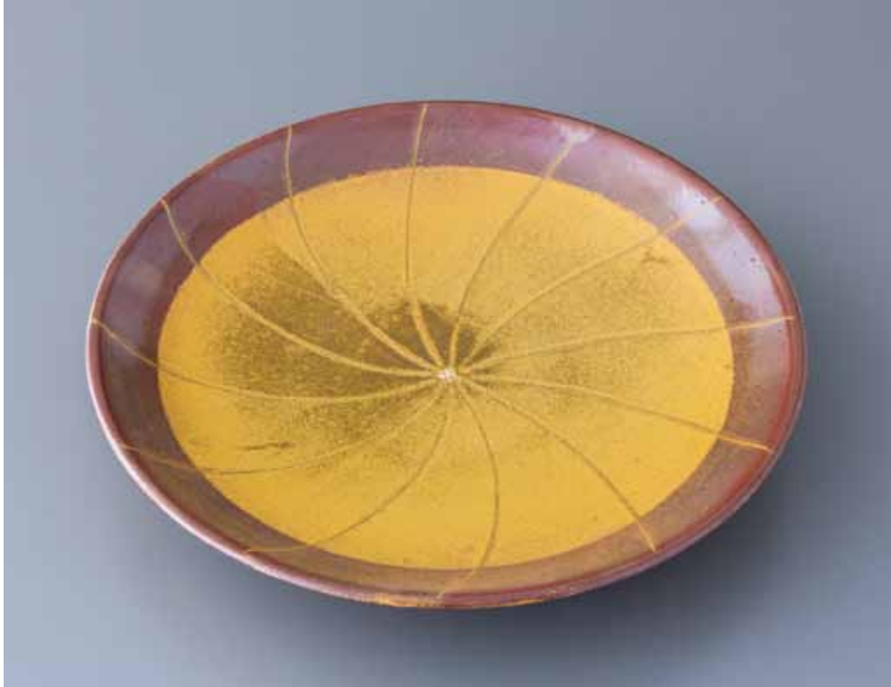
Yohen plate yellow kaki glaze 2.5 x 16 x 16" YH510