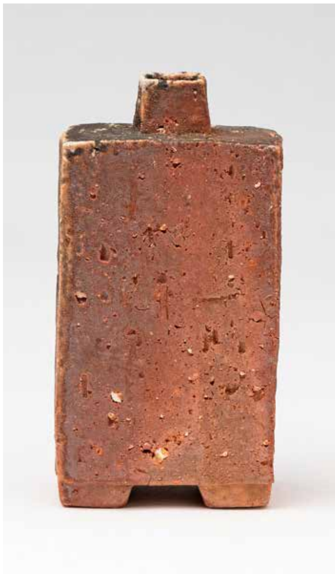
Rectangular Vase Yohen glaze 7 x 3.75 x 2.5" MK1432