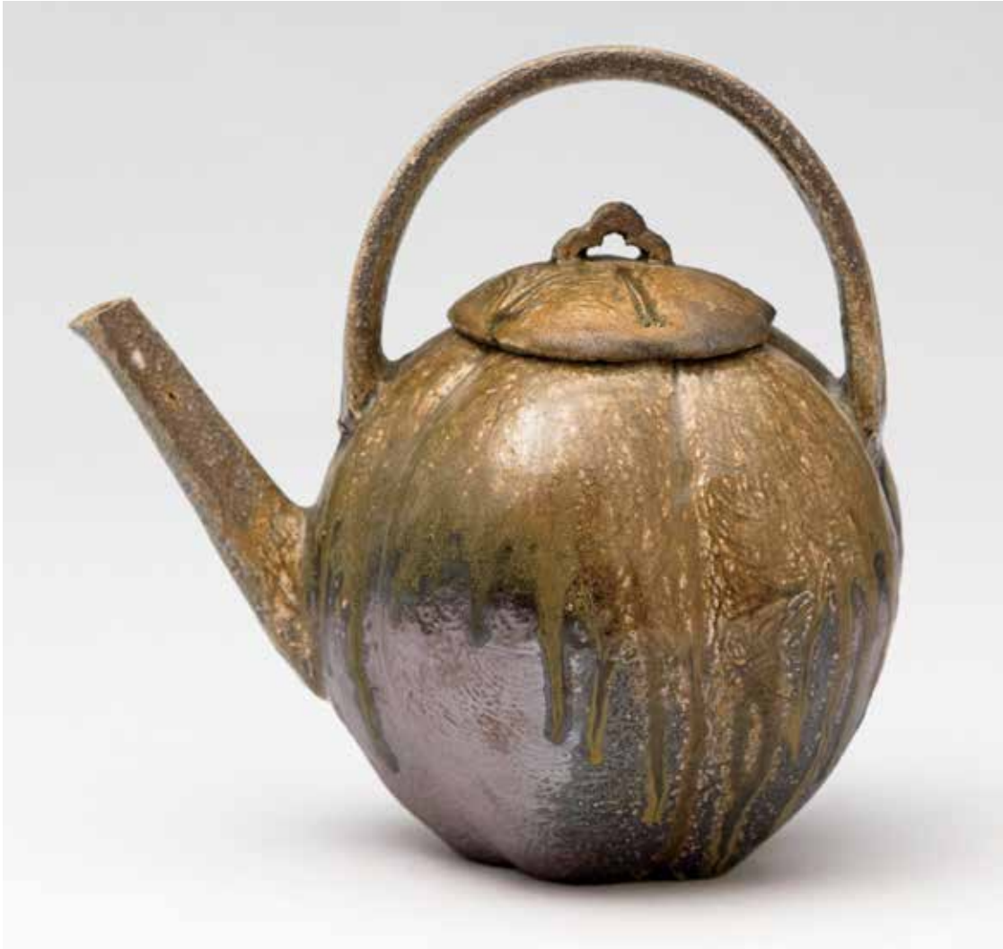
Mizutsugi Yohen natural ash glaze 9 x 8.75 x 6.5" MK1450