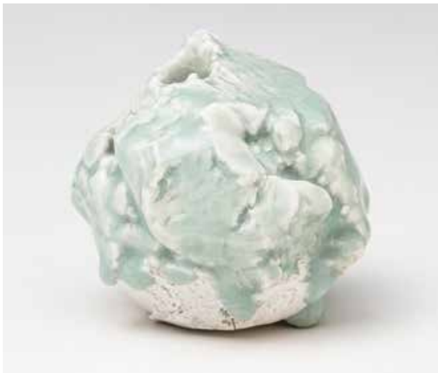
Toukaiseki Vase Seihaku glaze 3.75 x 4 x 4" MK1416