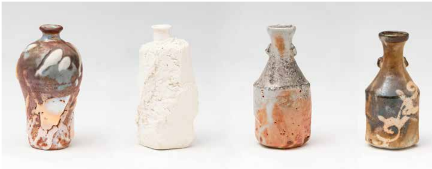
Sake Bottle Yohen shino glaze 6.25 x 3.5 x 3.5" MK1458