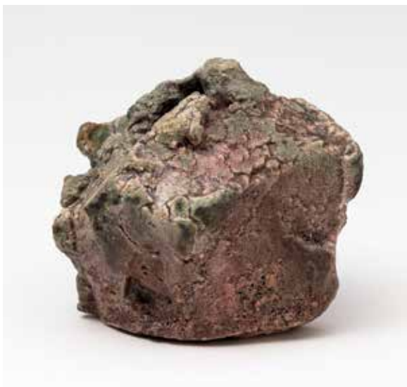
Toukaiseki Vase Yohen natural ash glaze 3.75 x 4.5 x 4.5" MK1413