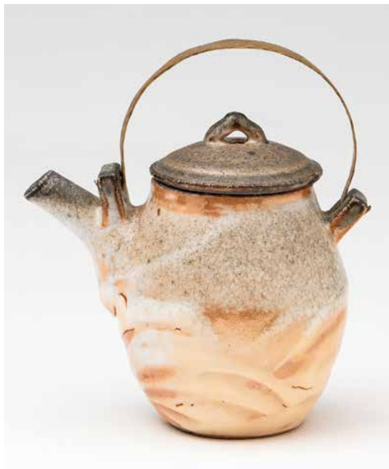
Tea Pot Yohen shino glaze 6.25 x 6.75 x 4.75" MK1451