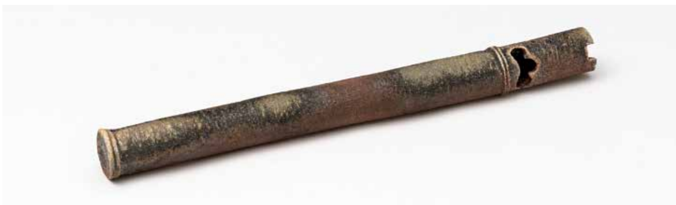
Kakehana Yohen natural ash glaze 2 x 14.75 x 1.5" MK1484