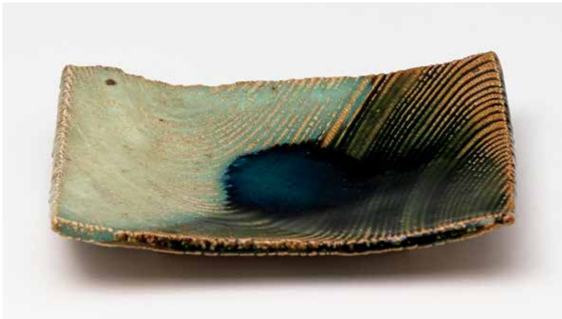
Kakewake Plate Oribe glaze 4 x 7.5 x 6.25" MK1474