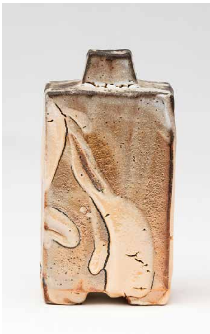
Rectangular Vase Yohen shino glaze 7 x 3.75 x 2.5" MK1428