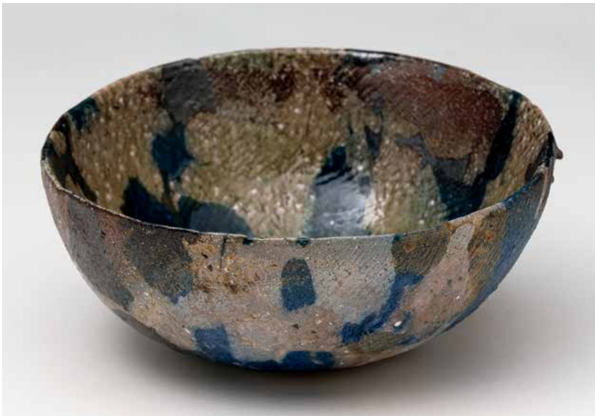
Neriage Bowl Yohen glaze 5.25 x 11.5 x 11.5" MK1465