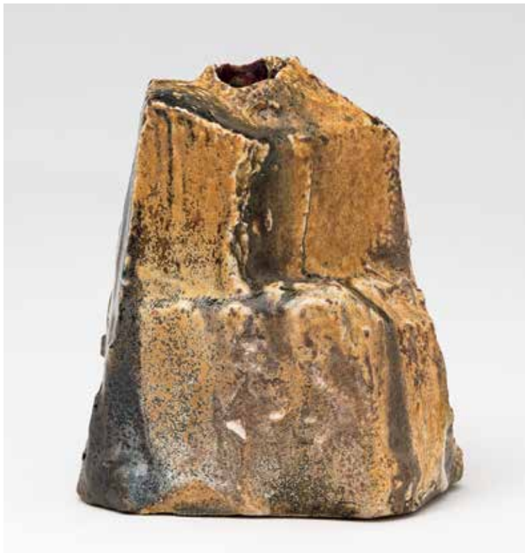
Toukaiseki Vase Yohen soda glaze 7 x 6 x 6" MK1392