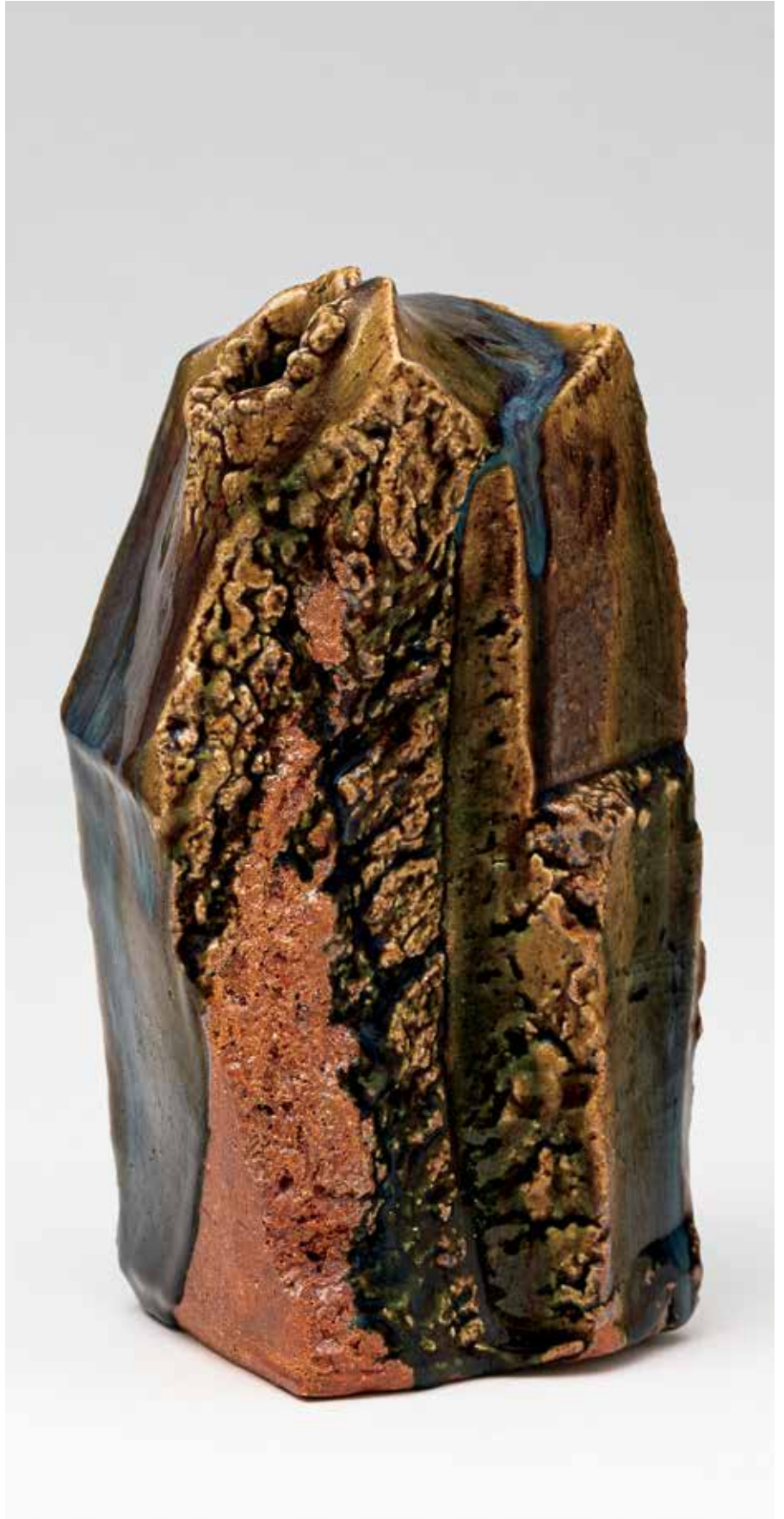
Toukaiseki Vase Oribe glaze 10.25 x 5.5 x 5.5" MK1388