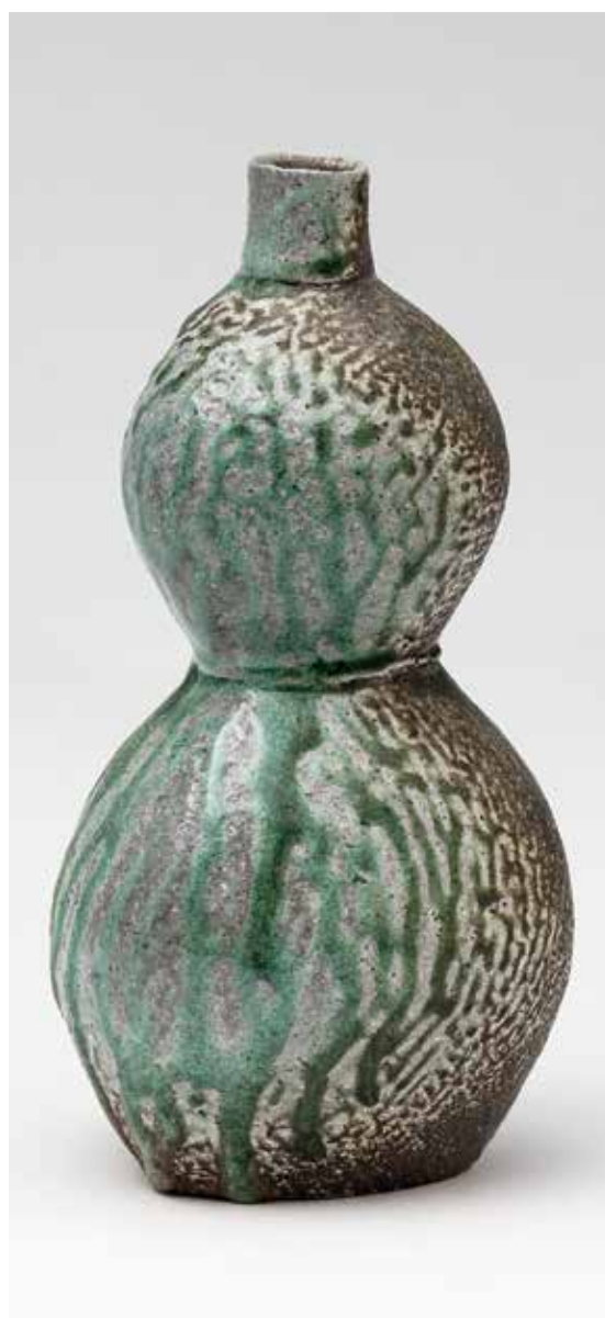
Hisago Vase Yohen soda glaze 9.5 x 5 x 5" MK1370