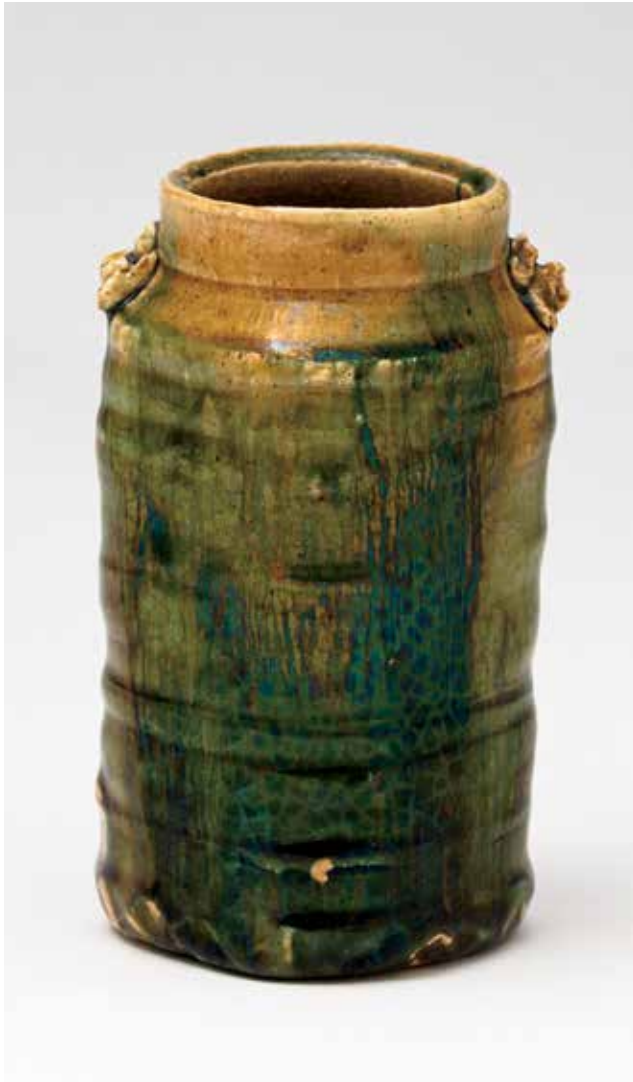
Vase Oribe glaze 7.75 x 3.5 x 3.5" MK1422