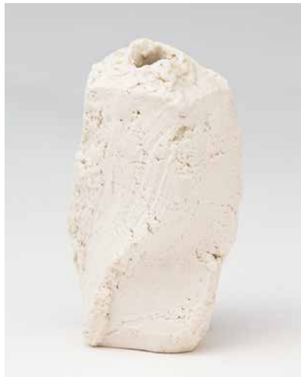
Toukaiseki Vase Hakuji glaze 6 x 3.75 x 3.75" MK1412