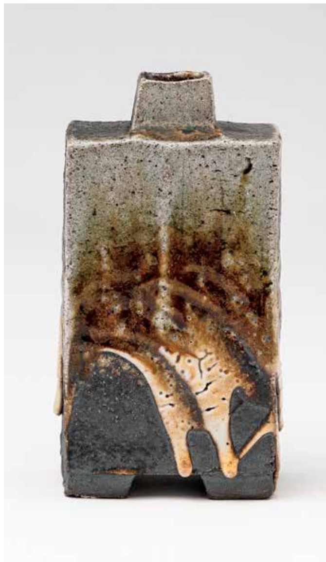
Rectangular Vase Yohen soda glaze 7 x 3.5 x 2.5" MK1434