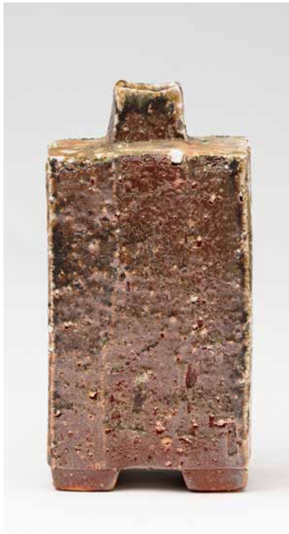
Rectangular Vase Yohen natural ash glaze 7 x 3.5 x 2.5" MK1429