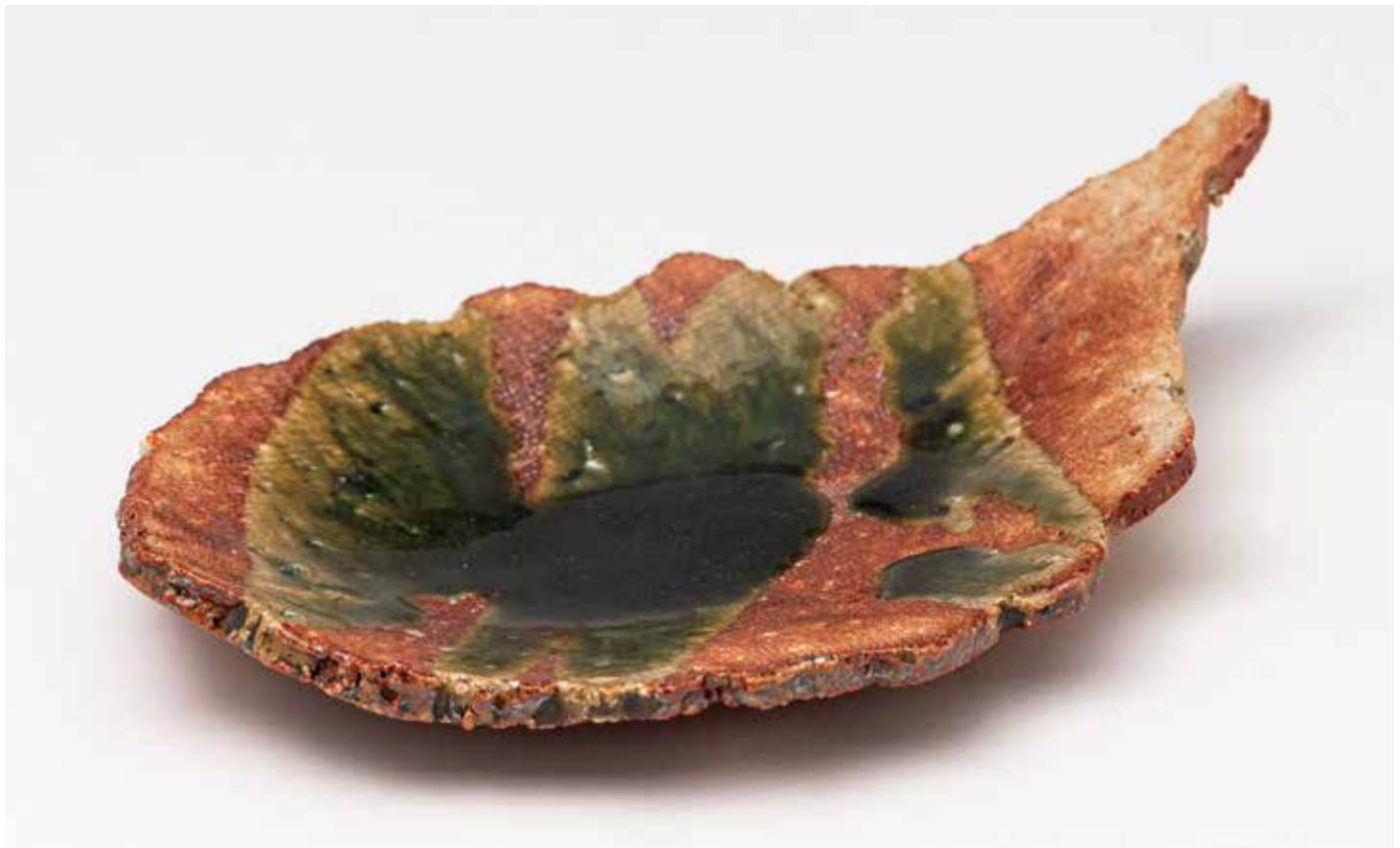
Ryuumonn Kasiwa Plate Oribe glaze 3 x 10 x 6.75" MK1473