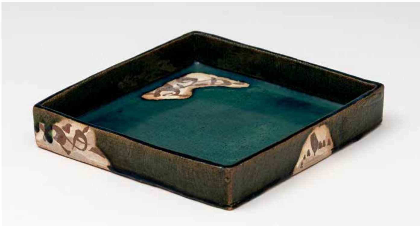
Square Plate Oribe glaze 1.75 x 10 x 10" MK1467