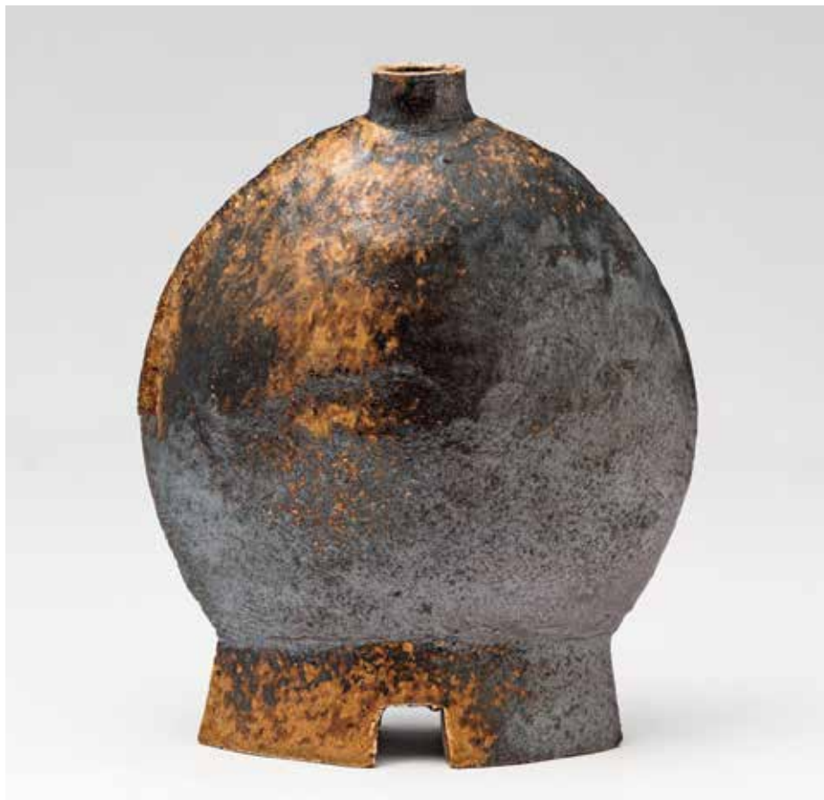
Round Flat Vase Yohen natural ash glaze 9.5 x 7.5 x 3.75" MK1425

and sifted. The powdered clay is mixed with an excess of water, left to hydrate as fully as possible, filtered, and then placed out to dry to the correct hydration. Typically, over a period of about half a year, the potter works tirelessly to meticulously shape nearly each pound into objects of use, such as plates, vases, and teapots. Even the humble rim of a cup, if not properly compressed and shaped, can cause a surprisingly terrible drinking experience. These completed works must be set out to dry completely. It is here that the work is in its most delicate state, and it is in this state that it is subjected to immense temperatures in the firing of the kiln. Top temperatures in the kiln are so extreme that its light alone can blind a person over time. The amount of wood required to continuously feed this burning flame over many days rivals the weight of an elephant. Though approaches vary, this is the general flow of the potter's art, and it takes slow and