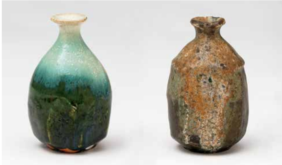
Sake Bottle Oribe glaze 5.5 x 3 x 3" MK1462