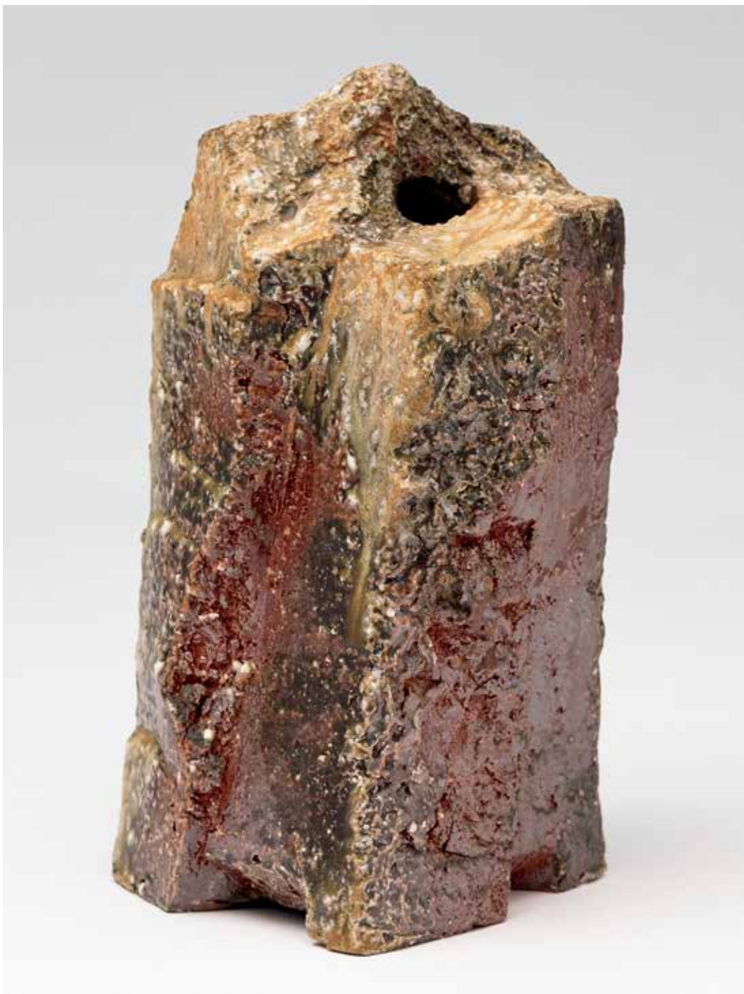
Toukaiseki Vase Yohen natural ash glaze 11 x 6.25 x 6.25" MK1383