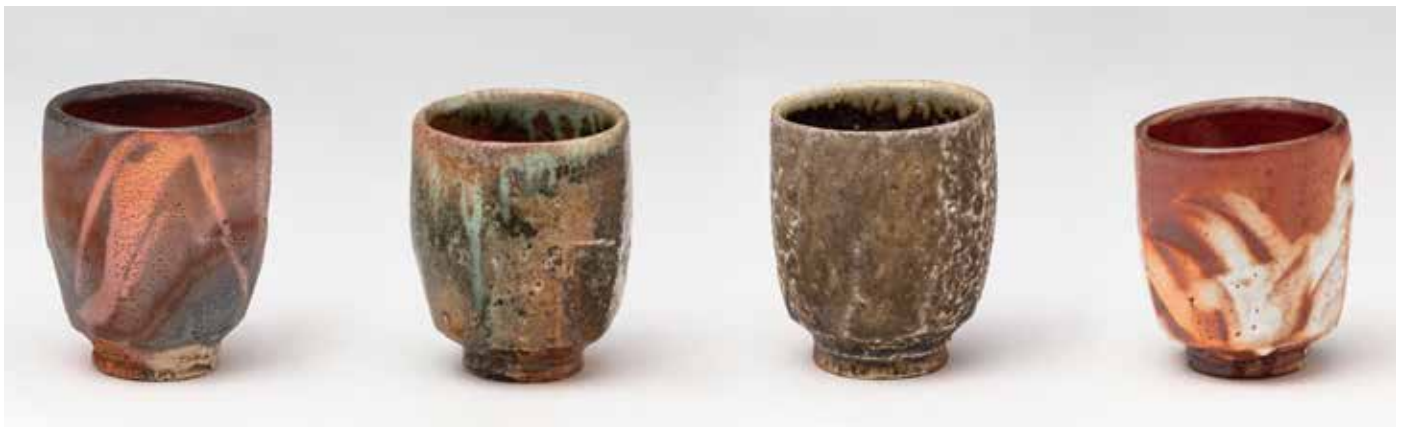
Cup Yohen shino glaze 4.25 x 3.5 x 3.5" MK1504