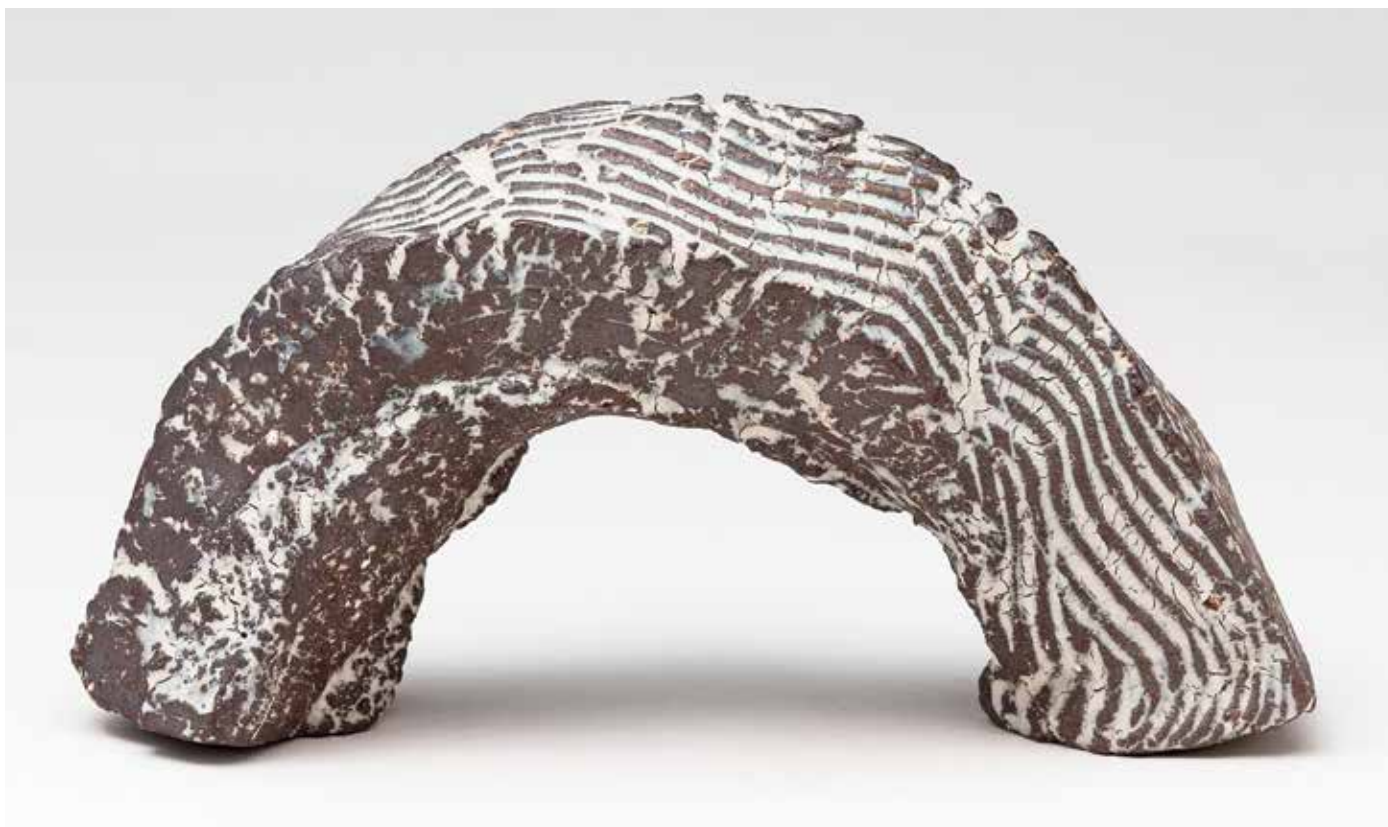
Toukaiseki Vase Yohen glaze with inlay 6.25 x 12 x 3.75" MK1393