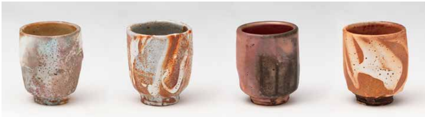
Cup Yohen shino glaze 4 x 3.5 x 3.5" MK1493