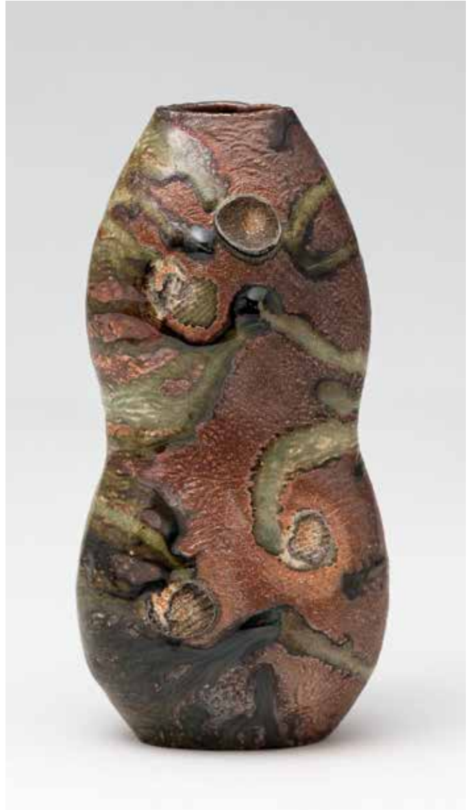
Hisago Vase Yohen natural ash glaze 10 x 5 x 5" MK1371