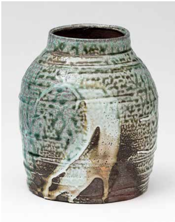
Vase Yohen soda glaze 8 x 7 x 7" MK1374