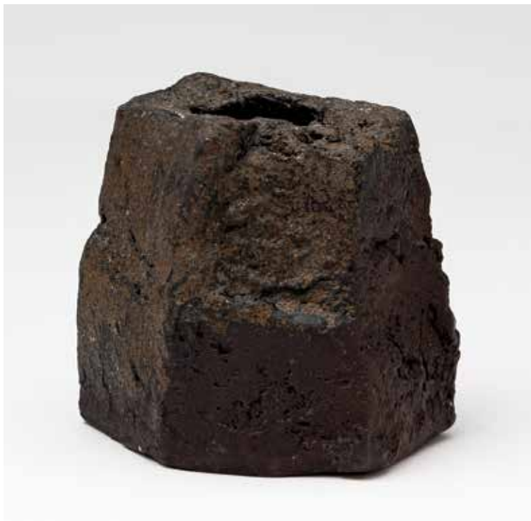
Toukaiseki Vase Yohen yuugen glaze 5 x 5.5 x 5.5" MK1403