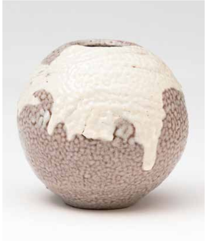
Small Vase Mashiko glaze, hand brushed 5.75 x 6 x 6" MK1438