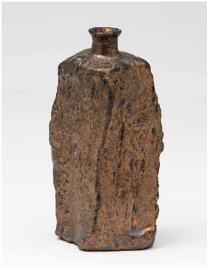
Toukaiseki Vase Yohen glaze 7 x 3.75 x 3.75" MK1401