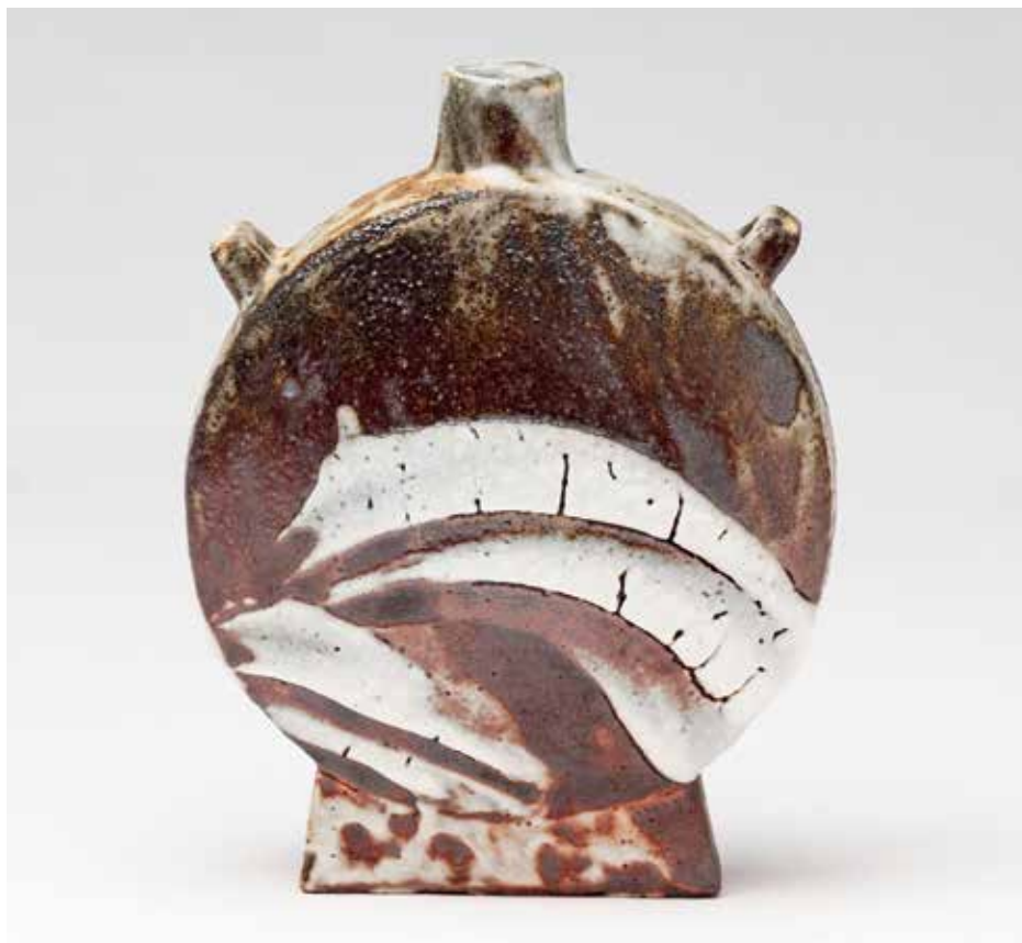
Round Flat Vase Yohen shino glaze 8.5 x 6.75 x 3.25" MK1426

steady time. At times it is quite dull, at other times very intense, but if any of it is rushed, it generally will show. The potter must be perpetually engaged. This traditional practice with the elements and the sheer mass and physicality of the work roots the potter in the necessities, boundaries, and character not only of our material world, but of the internal world of self-discipline and human character. A potter thinks about how to make items that speak to people and are useful, but they also often work vigorously to compete with their own physical limitations to produce their work. These struggles with material, mind, and body are easier said than done. Patiently sculpting a small mountain of clay into an abundance of diverse and complex objects then giving them over to a single firing, powered for days by both body and wood, is more than just physically and mentally exhausting. I often call the firing of the kiln a 'spirit journey,' a continual process of asking the kiln questions to find out where it is,