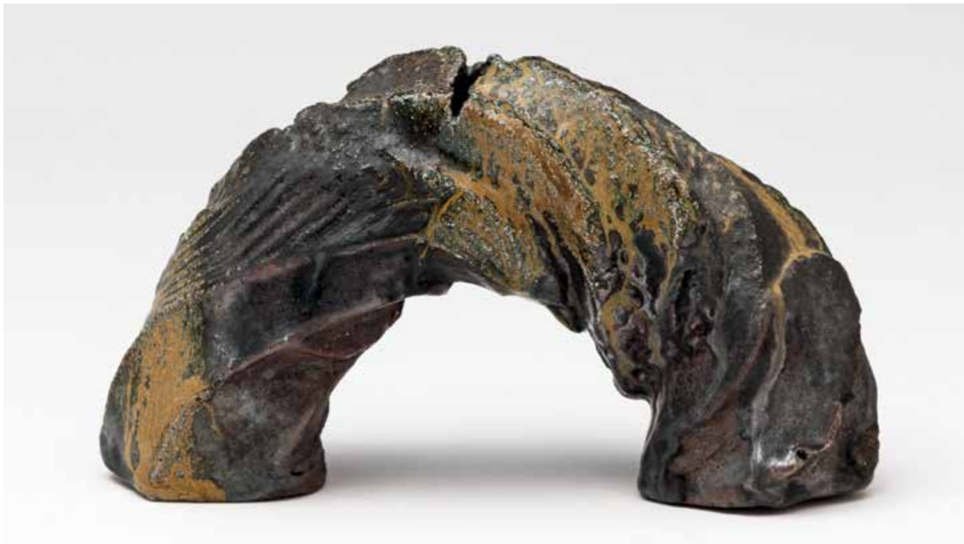
Toukaiseki Vase Yohen yuugen glaze 6 x 10.75 x 3.5" MK1394