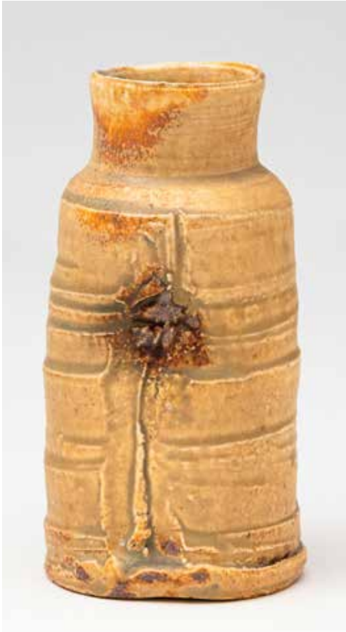
Vase Kiseto glaze 7 x 3.75 x 3.75" MK1421