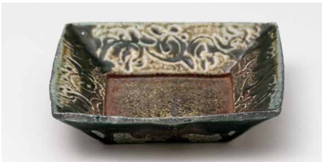
Square Plate Yohen soda glaze 1.75 x 7 x 7" MK1477