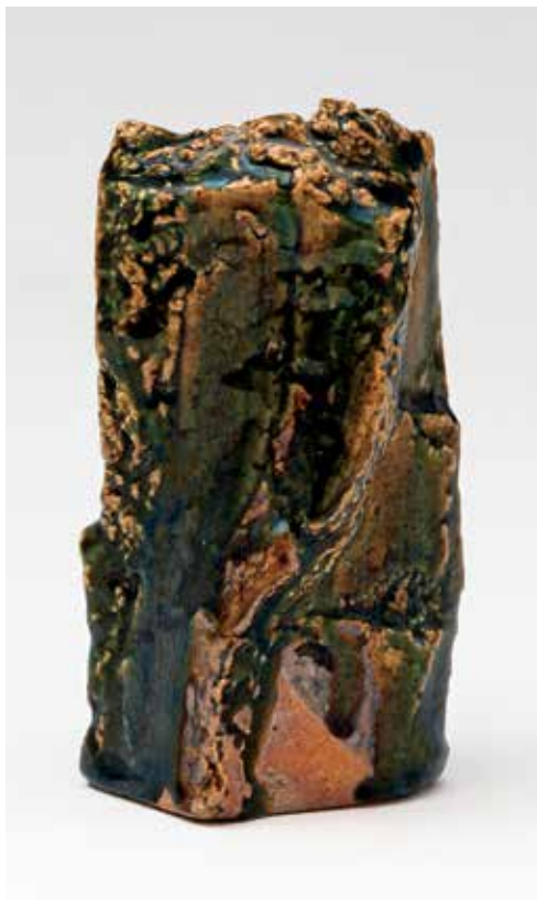
Toukaiseki Vase Oribe glaze 7 x 3.5 x 3.5" MK1409