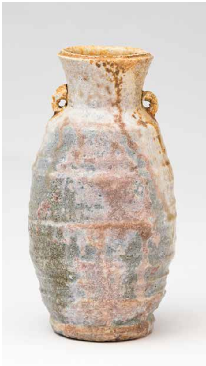
Vase Yohen natural ash glaze 8.25 x 4.75 x 4.75" MK1418