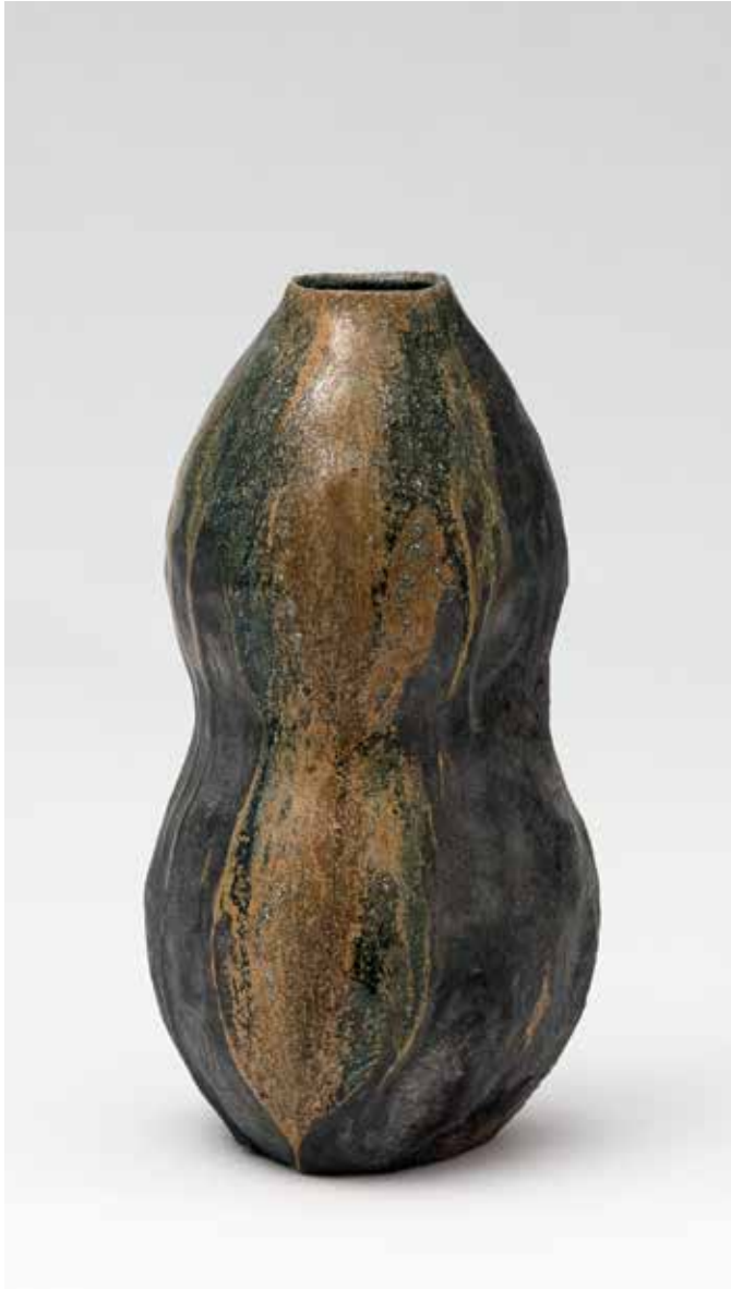
Hisago Vase Yohen soda glaze 8.5 x 4.5 x 4.5" MK1372