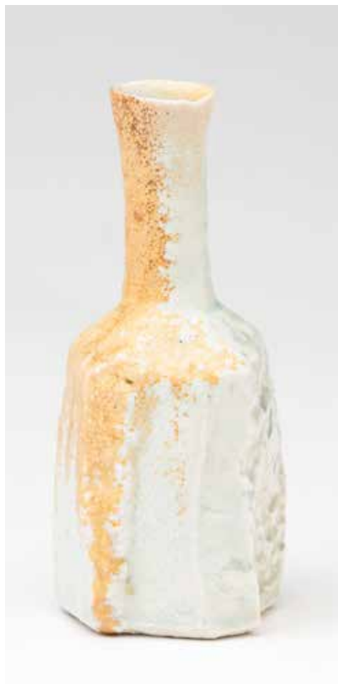
Toukaiseki Vase Seihaku natural ash glaze 7.5 x 3.5 x 3.5" MK1402