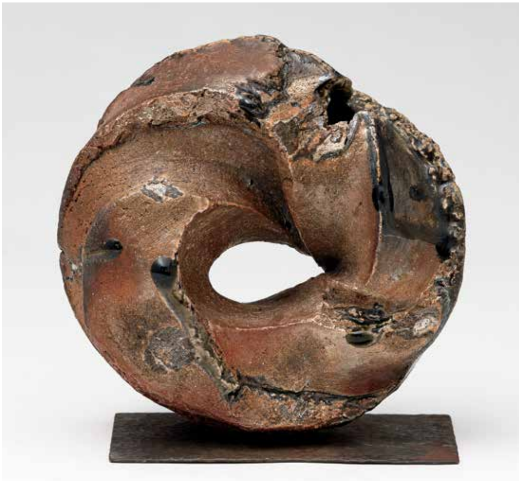
Toukaiseki Vase with Metal Base Yohen natural ash glaze 9.75 x 9.5 x 5" MK1378