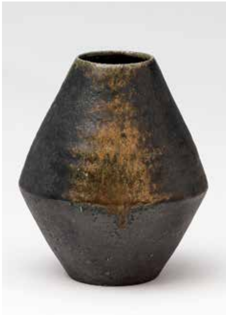
Vase Yohen yuugen glaze 5.5 x 4.5 x 4.5" MK1423