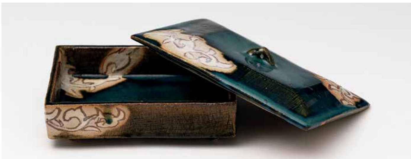
Box Oribe glaze 3.5 x 9 x 6.75" MK1481