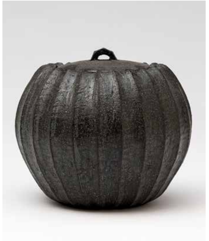
Water Container Yuugen shinogi glaze 6.5 x 6.5 x 6.5" MK1444