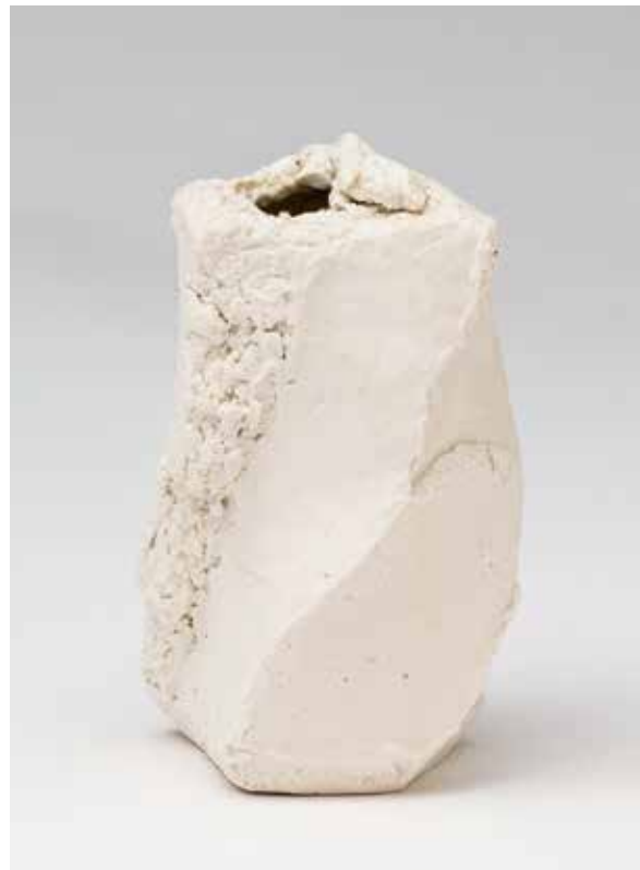
Toukaiseki Vase Hakuji glaze 6 x 3.5 x 3.5" MK1411