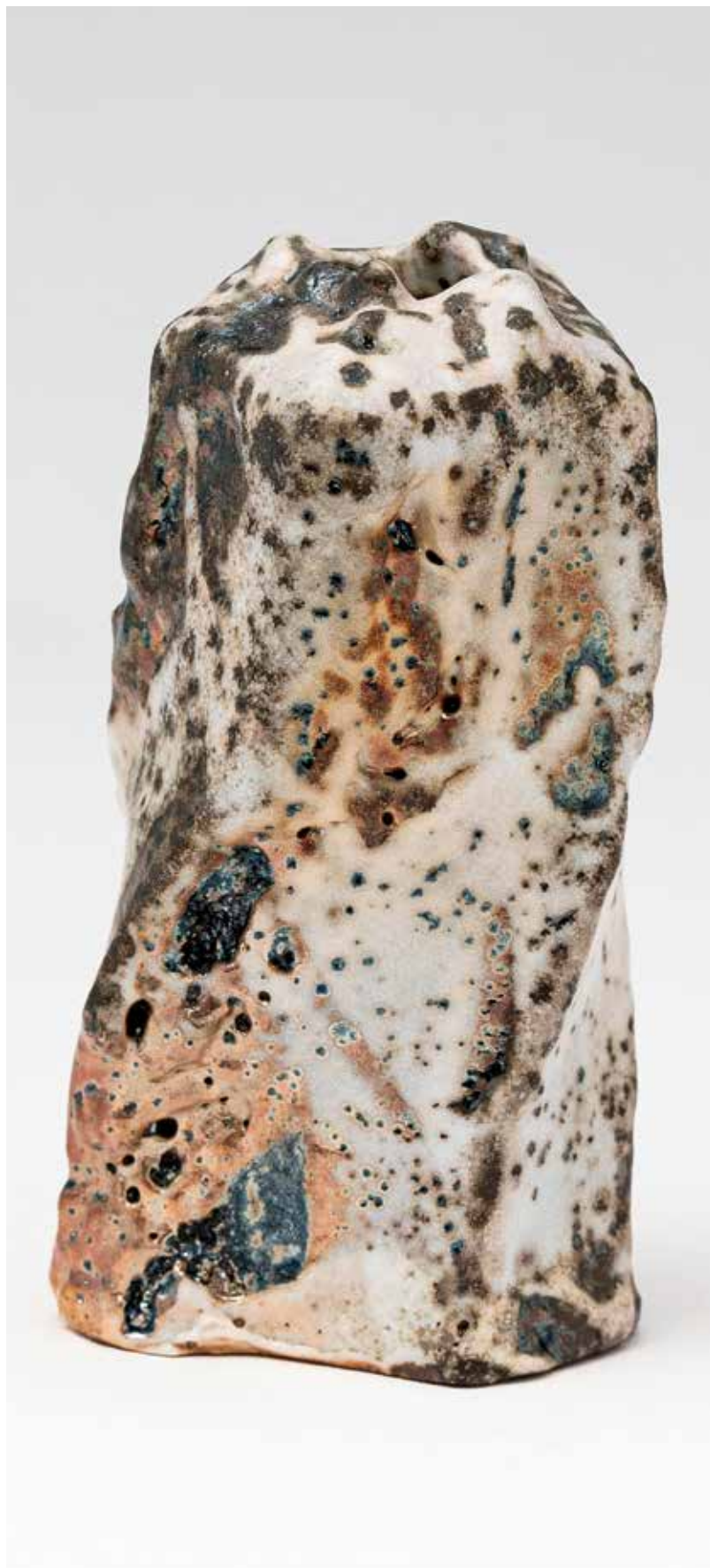
Toukaiseki Vase Yohen shino glaze 14 x 7.5 x 7.5" MK1396