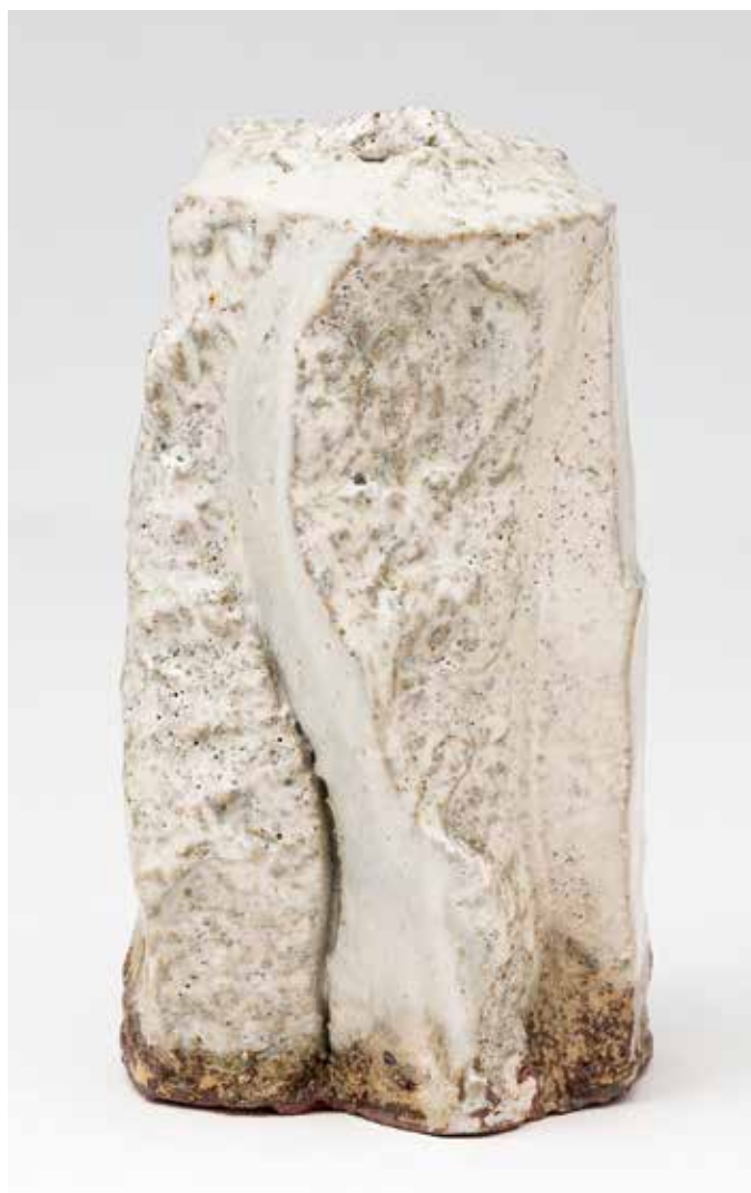
Toukaiseki Vase Mashiko kohiki glaze 8.75 x 5 x 5" MK1391