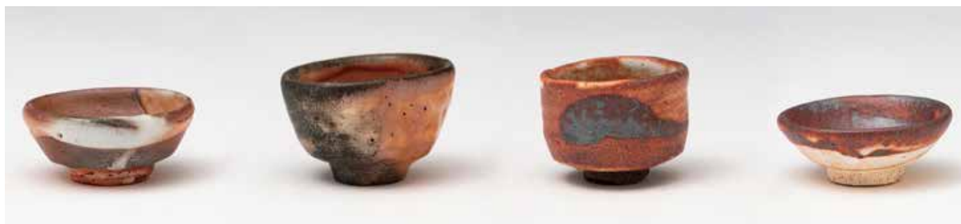
Sake Cup Yohen shino glaze 1.75 x 3.5 x 3.5" MK1521