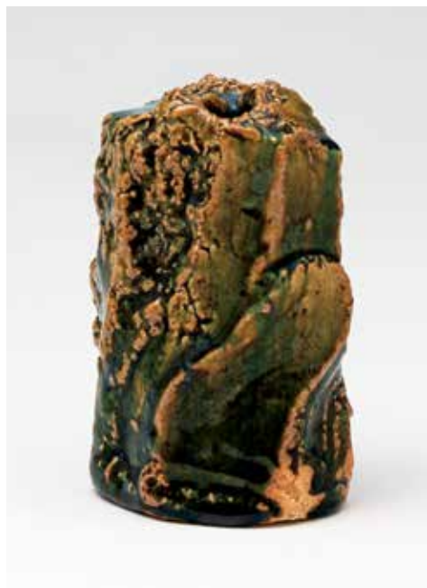
Toukaiseki Vase Oribe glaze 5.5 x 3.5 x 3.5" MK1410