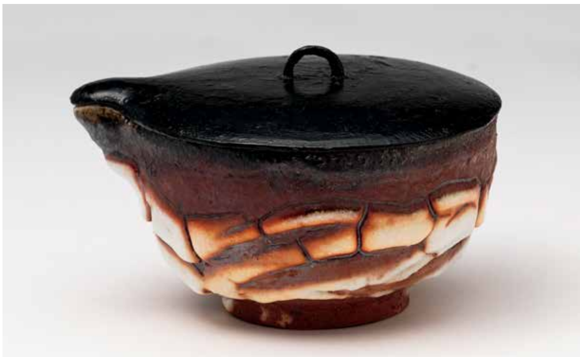
Katakuchi Water Container Tetsu shino glaze 5.75 x 9.25 x 8" MK1470