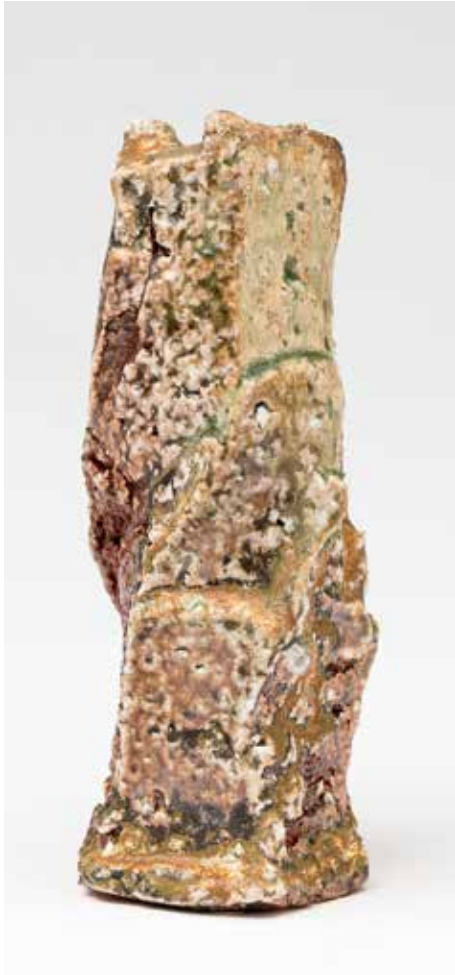
Toukaiseki Vase Yohen natural ash glaze 6.75 x 3.25 x 3.25" MK1399