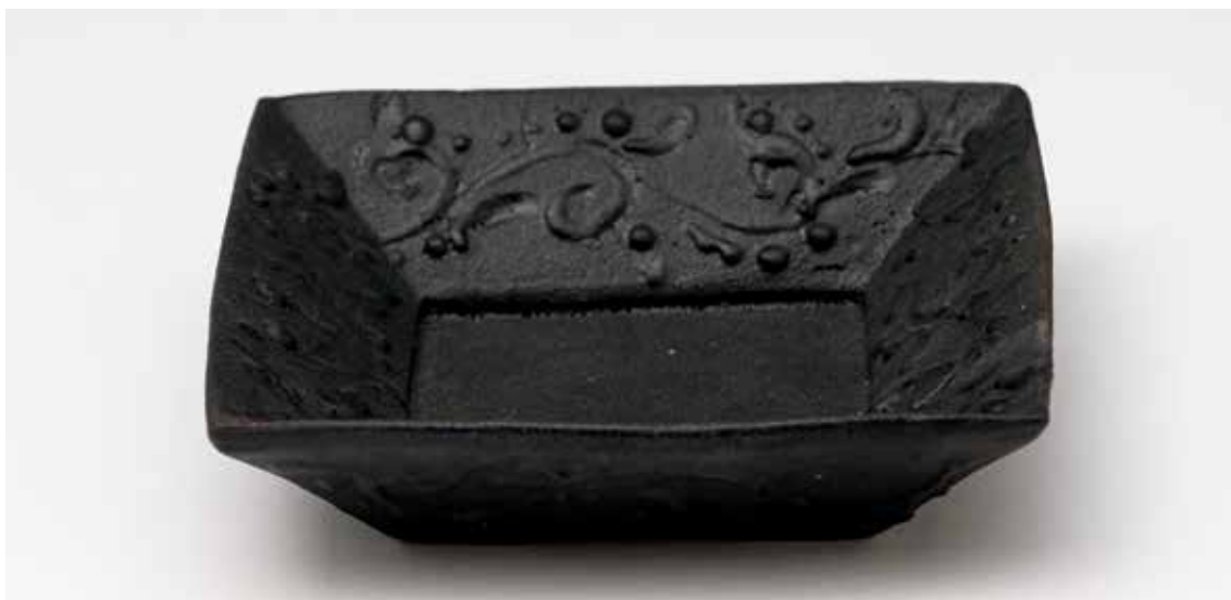
Plate Yuugen karakusa glaze 1.75 x 7 x 7" MK1480