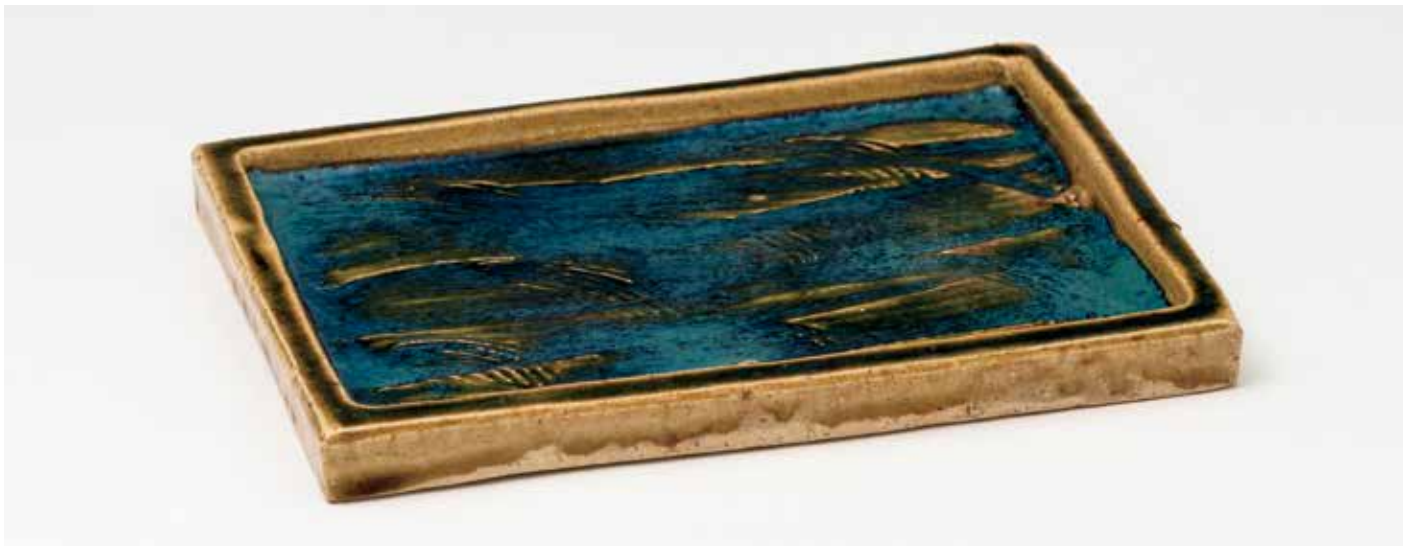
Plate Oribe glaze .75 x 9.5 x 7.5" MK1482