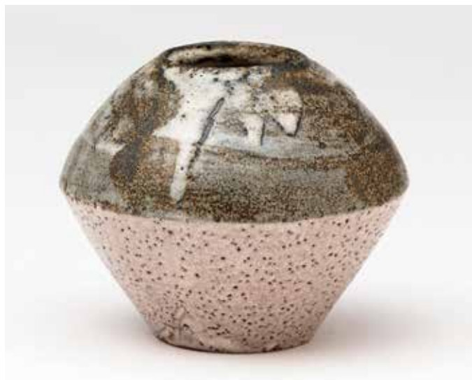
Small Vase Tsshya glaze 4 x 5 x 5" MK1442