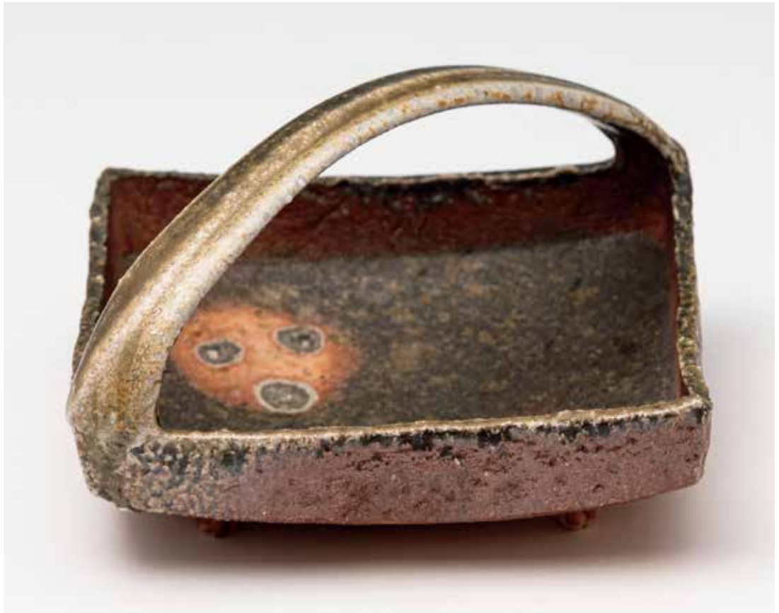
Square Plate with Handle Yohen natural ash glaze 5 x 8 x 8" MK1469