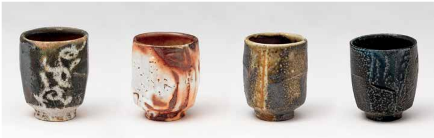
Cup Yohen shino glaze 4.25 x 3.75 x 3.75" MK1502