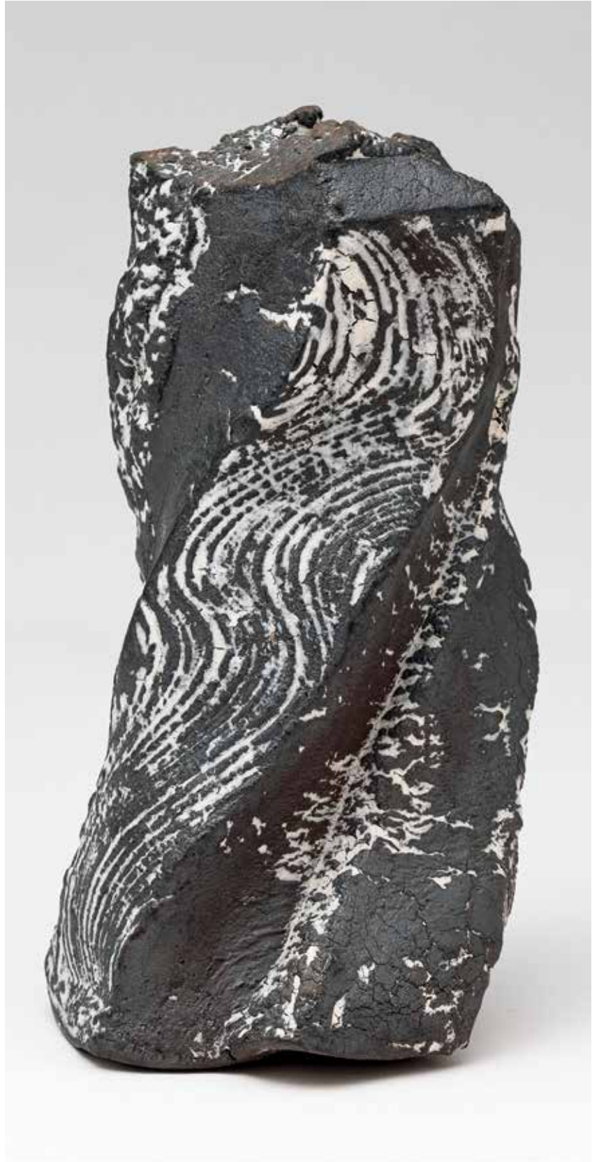
Toukaiseki Vase Yuugen glaze with inlay 12 x 7.75 x 6.5" MK1385