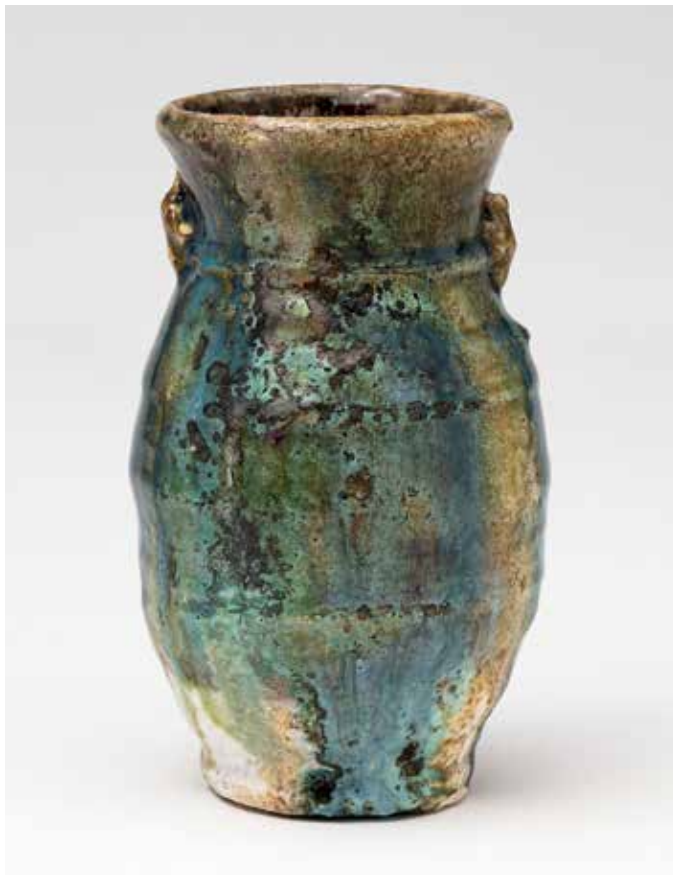
Vase Yohen oribe glaze 7.5 x 4.75 x 4.75" MK1417