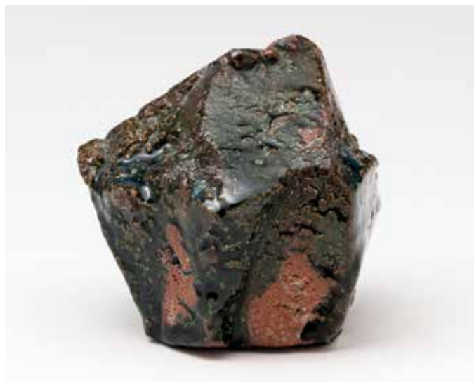
Toukaiseki Vase Oribe glaze 4.25 x 4.5 x 4.5" MK1415