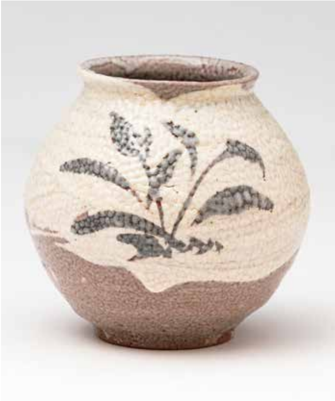
Small Vase Mashiko tetsue karakusa glaze 6 x 6.25 x 6.25" MK1437