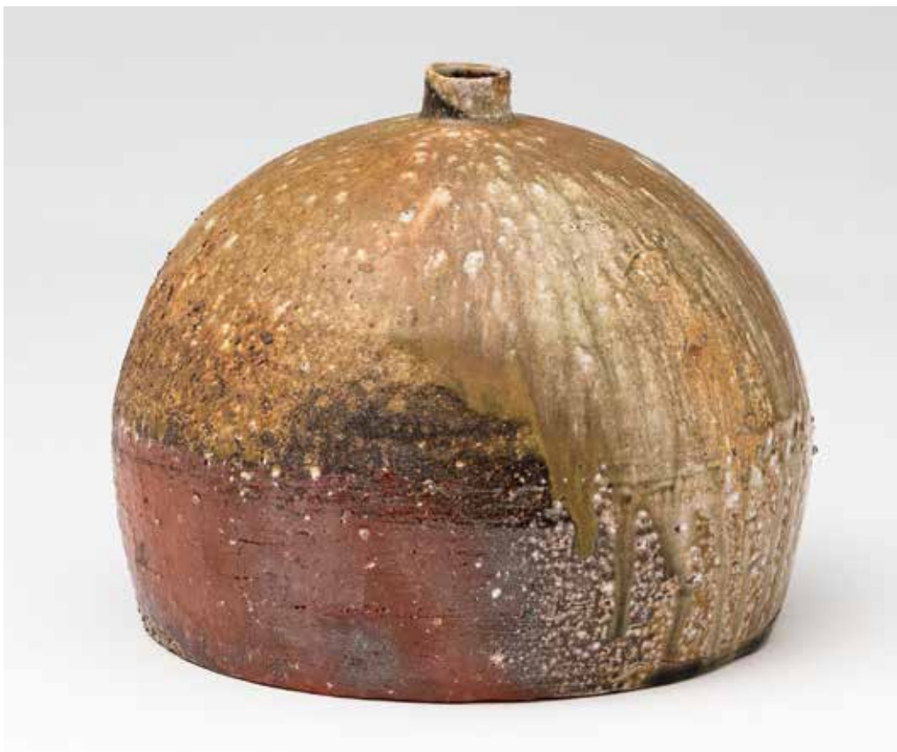
Vase Yohen natural ash glaze 8 x 9.5 x 9.5" MK1362

All works are stoneware and come with a wooden box.