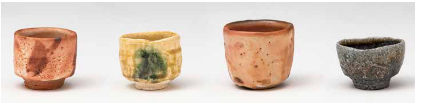
Sake Cup Shino glaze 2.5 x 2.75 x 2.75" MK1515