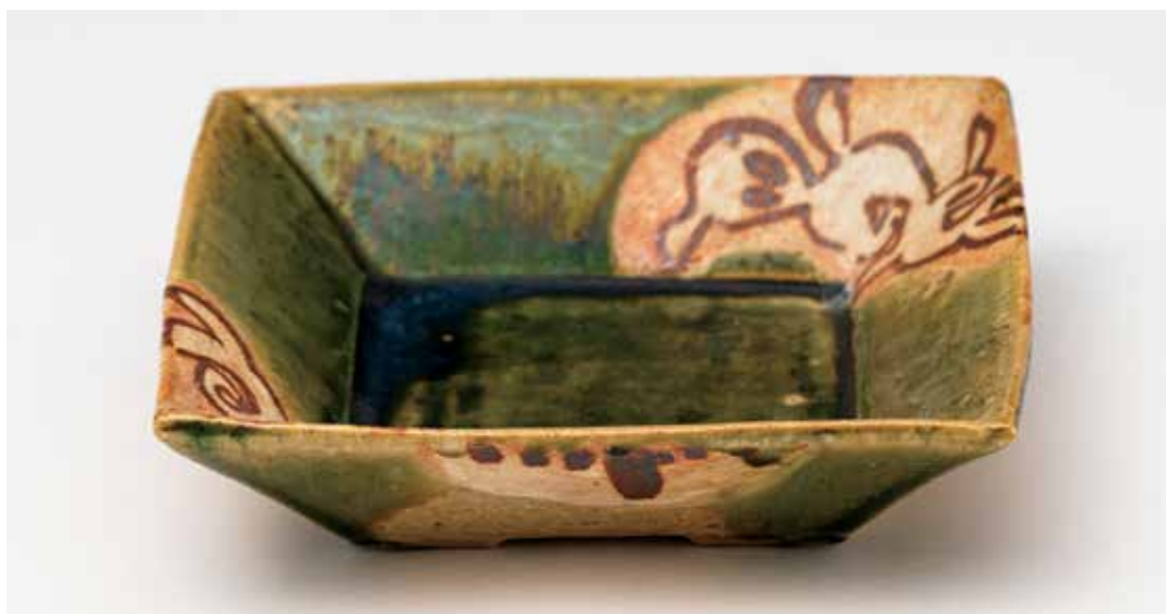
Square Plate Oribe glaze 1.75 x 6.75 x 6.75" MK1478