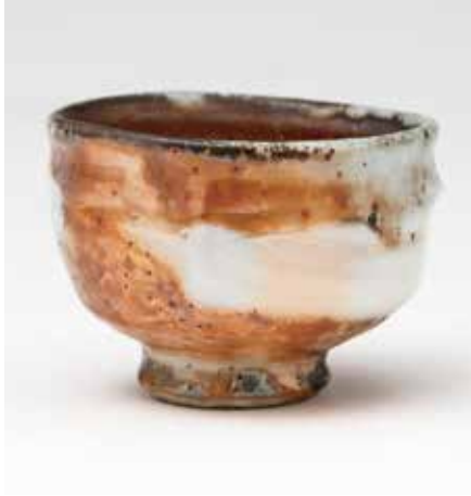
Tea Bowl Gold shino glaze 3.5 x 4.5 x 4.5" MK1446