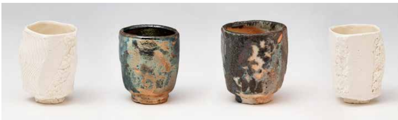
Toukaiseki Cup Hakuji glaze 4.25 x 3.25 x 3.25" MK1497