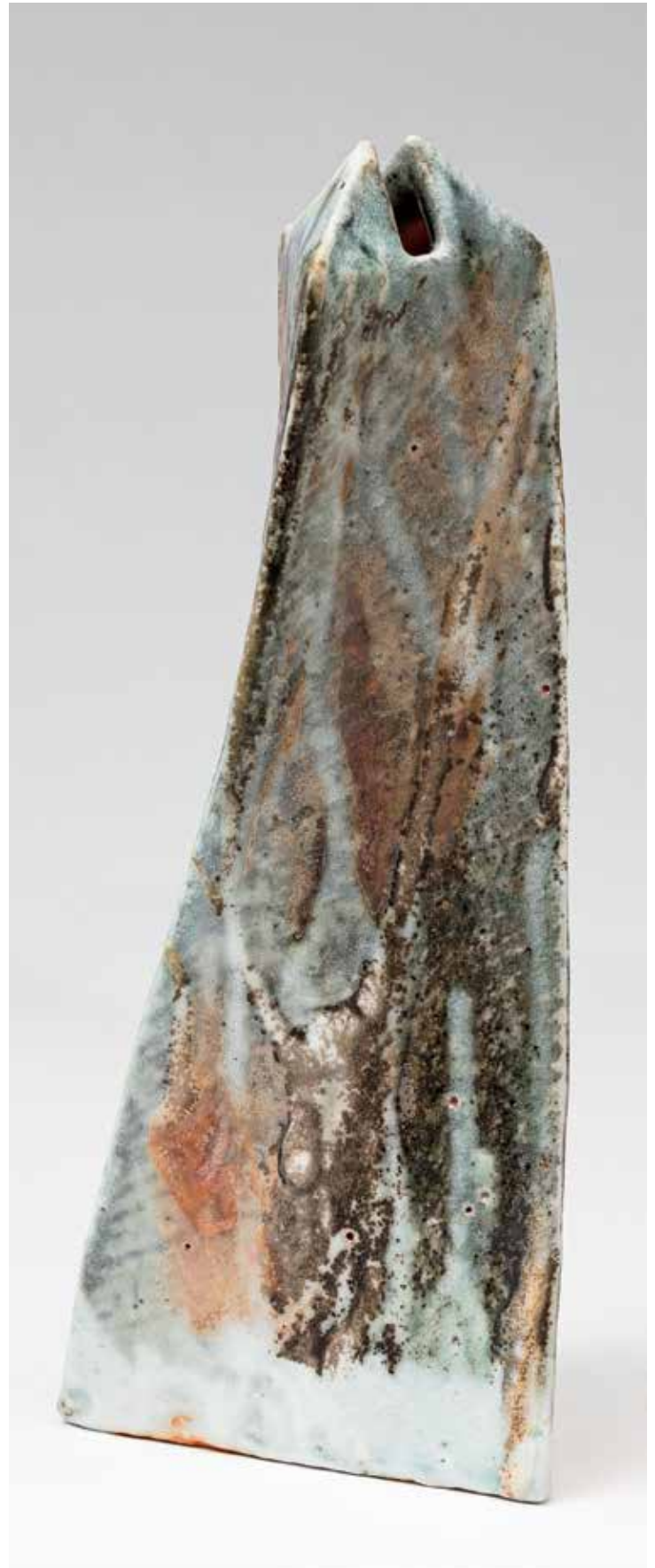
Vase Yohen shino glaze 14.25 x 6 x 6" MK1369