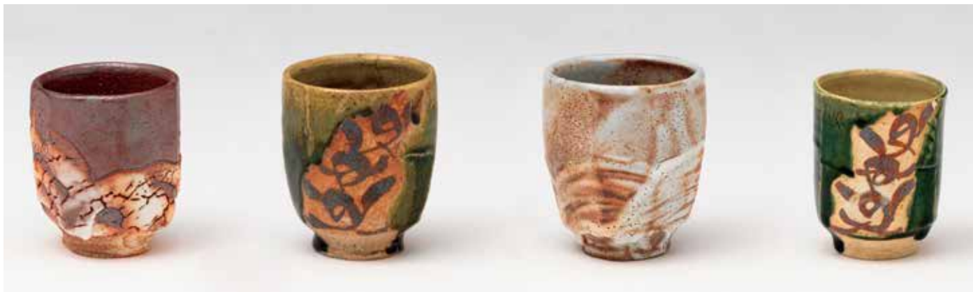
Cup Tetsu shino glaze 3.75 x 3.25 x 3.25" MK1500