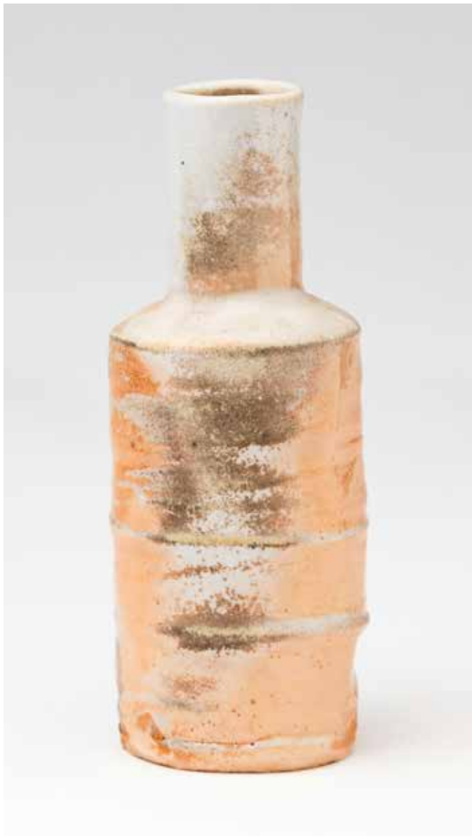
Vase Yohen shino glaze 8.75 x 3.5 x 3.5" MK1420