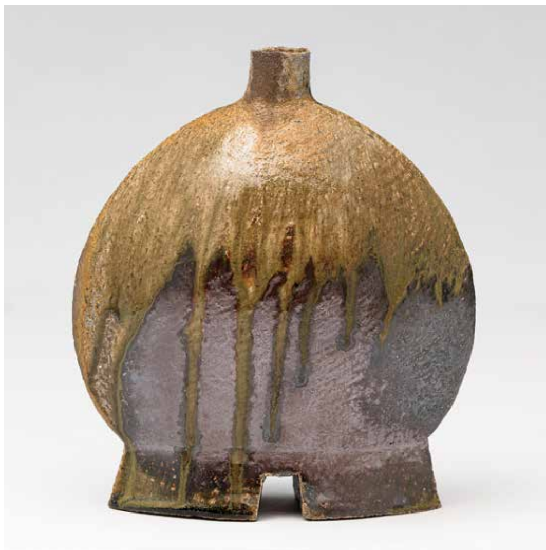
Round Flat Vase Yohen natural ash glaze 9 x 7.75 x 3.75" MK1424