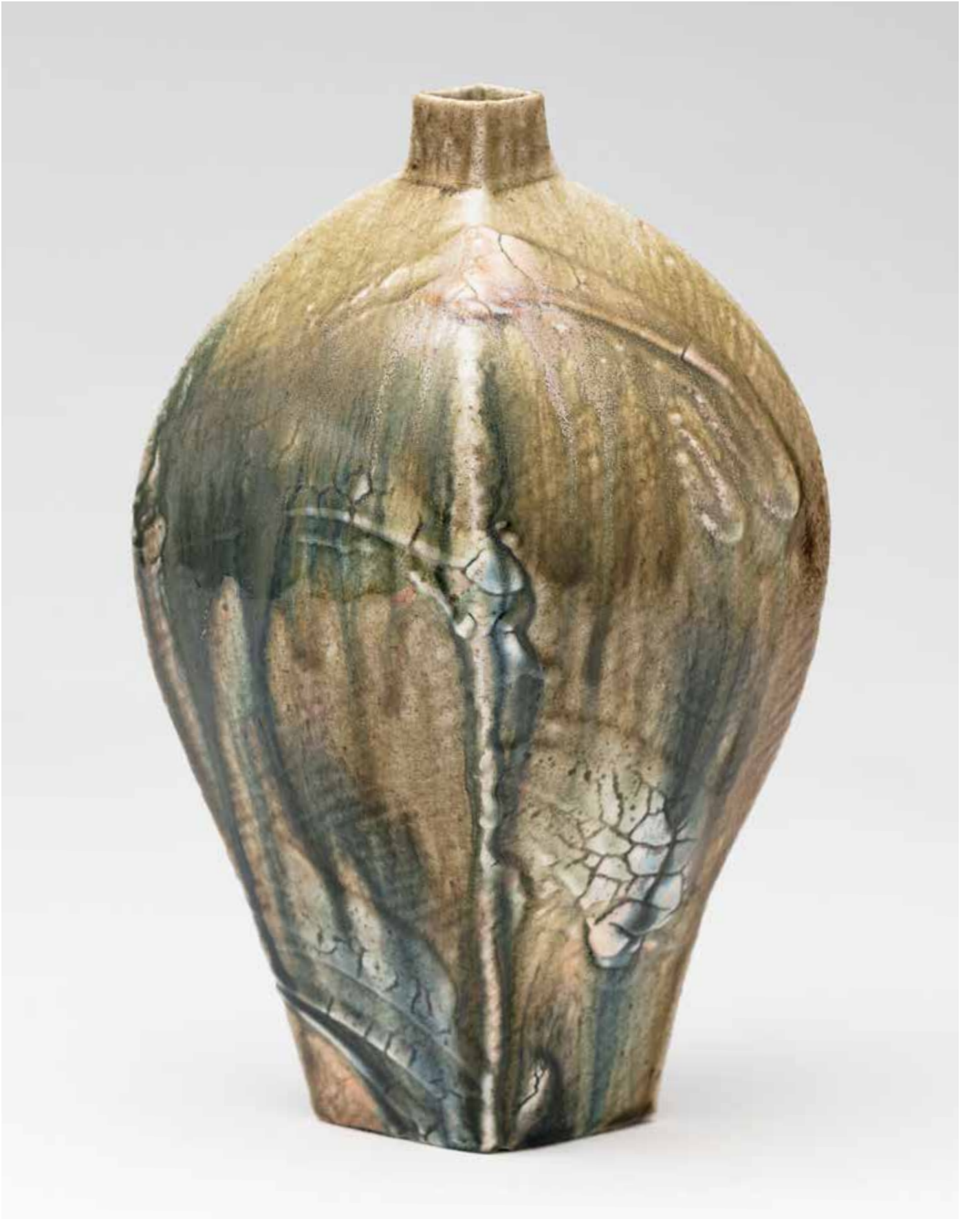
Vase Yohen soda glaze 13.75 x 9 x 7.25" MK1368