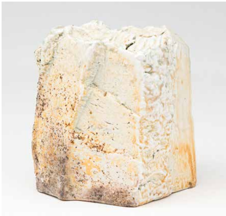
Toukaiseki Vase Hakuji natural ash glaze 7.5 x 6.75 x 6.75" MK1390