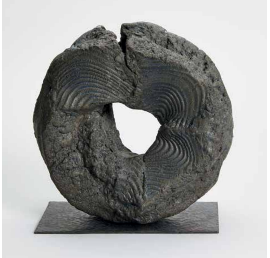
Toukaiseki Vase with Metal Base Yuugen enzo glaze 8 x 8.5 x 4.5" MK1361