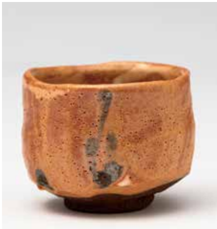
Tea Bowl Akebono shino glaze 3.5 x 4.5 x 4.5" MK1447