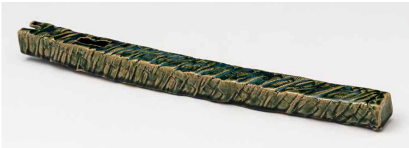
Kakehana Oribe glaze 1.75 x 18.5 x 1.5" MK1483