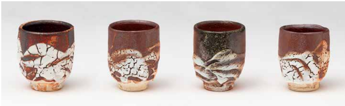
Cup Tetsu shino glaze 4.25 x 3.75 x 3.75" MK1496