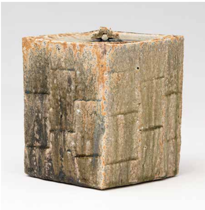
Water Container Yohen natural ash glaze 6.75 x 7.25 x 6.5" MK1443