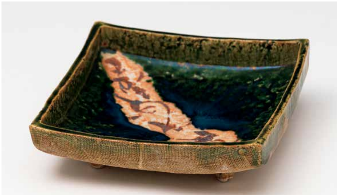
Square Bowl Oribe glaze 2.25 x 8 x 8" MK1475