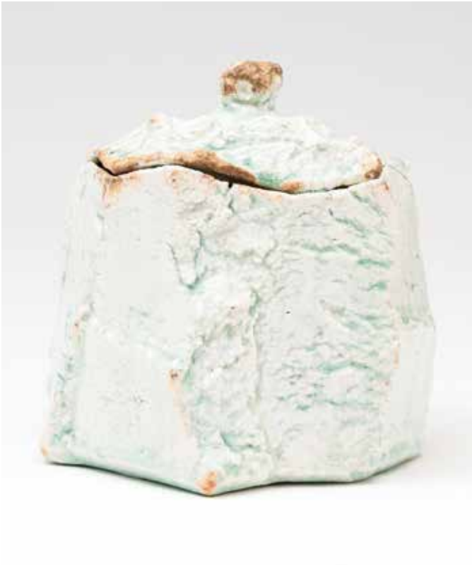
Toukaiseki Water Container Hakuji natural ash glaze 6.5 x 7.5 x 7.5" MK1445