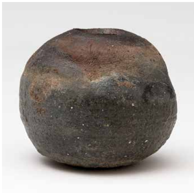
Small Vase Nanban glaze 5 x 6 x 6" MK1440