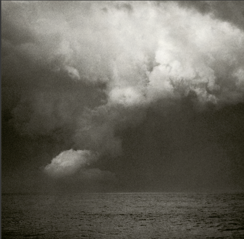
Gently Came the Tumult, 2023 Silver gelatin print 10 x 10" AS134