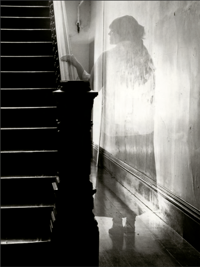
Held Briefly One to Another, 2023 Silver gelatin print 9 x 6.5" AS123