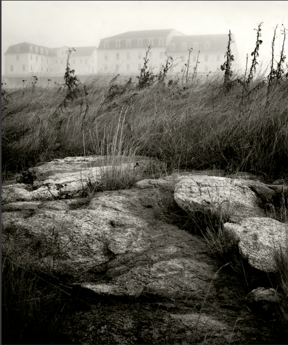
They Hold Time Lightly , 2023 Silver gelatin print 12 x 10" AS141

Epilogue... Ever since human beings first made marks upon a cave wall, we have told stories to bring meaning, understanding, and empathy to our shared existence. We might also extend that honor to stories integral to our own: those of every thing in nature alive or inanimate. Though their stories remain unspoken, it's my hope that we might imagine them nonetheless, and in so doing, cherish all, and include them in equal measure when we tell the story of our future.