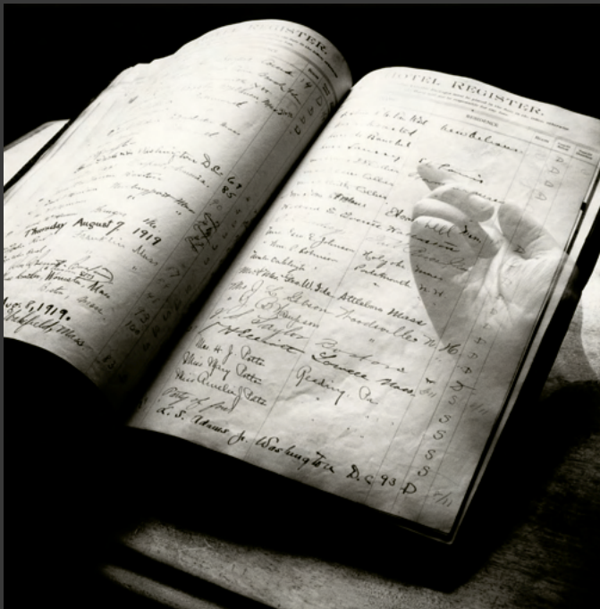
Here , 2013 Silver gelatin print 7.5 x 7.25" AS119