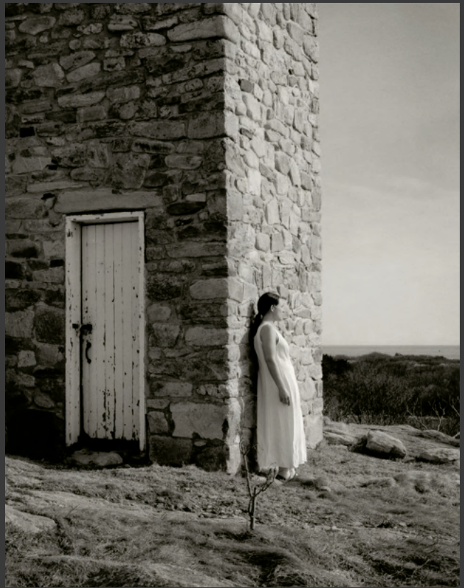
She Came to Be Alone , 2023 Silver gelatin print 9.25 x 7" AS133