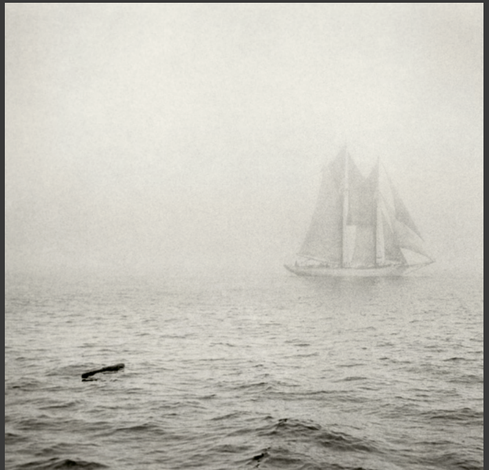
Leavings Through the Veil of Time , 2023 Silver gelatin print 7 x 7.25" AS140