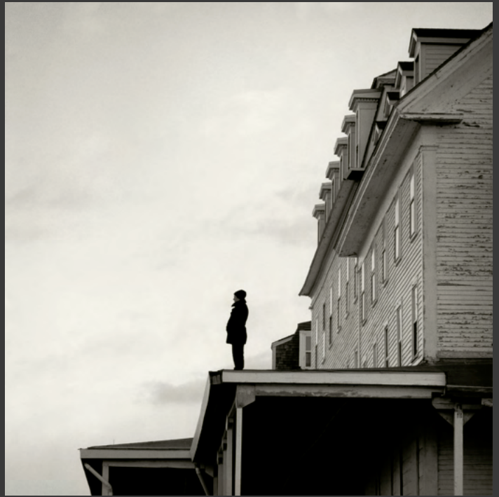
Lookout , 2023 Silver gelatin print 7.25 x 7.25" AS139