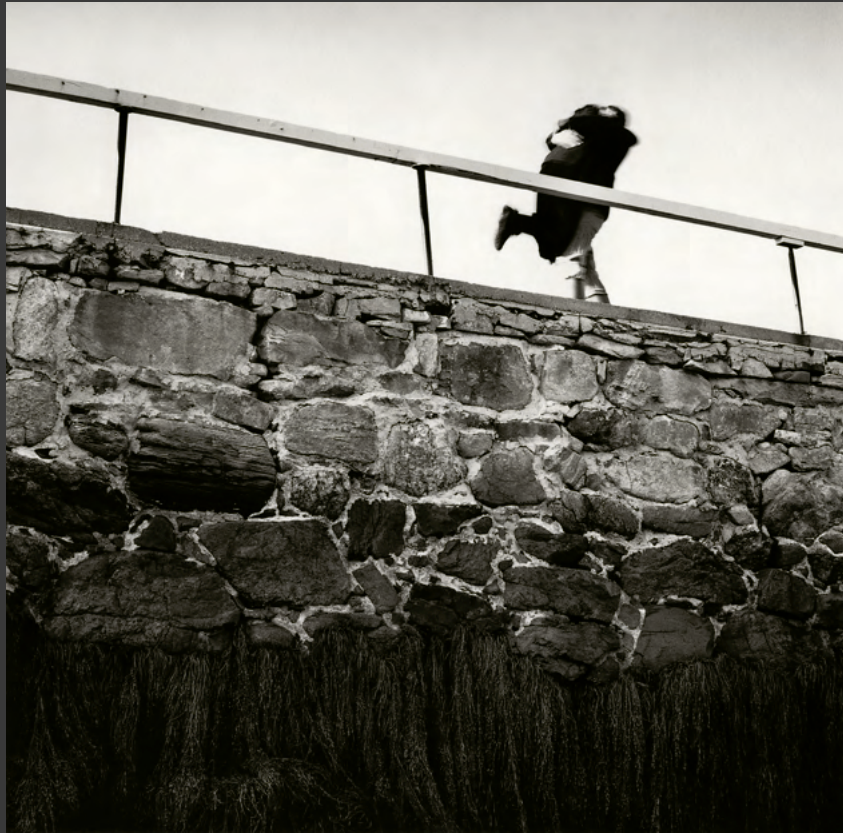
Stories: Chapter 21, 2013 Silver gelatin print 10 x 10" AS118