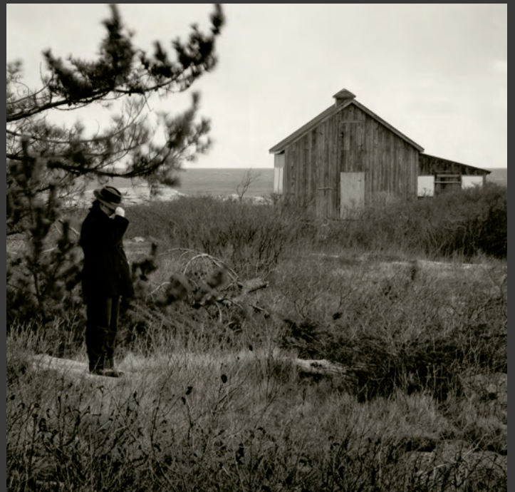
And the Wind Came, 2023 Silver gelatin print 7 x 7.25" AS137