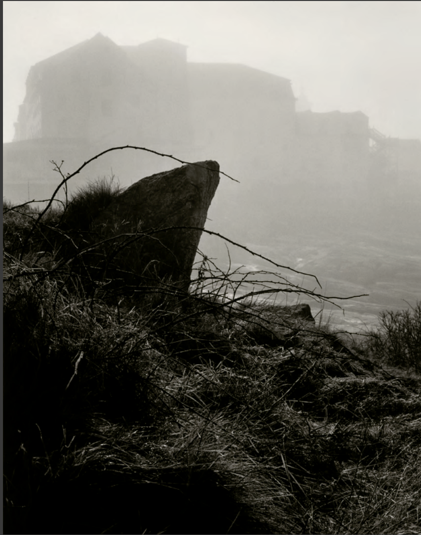
Geologic Time , 2023 Silver gelatin print 12.5 x 10" AS125