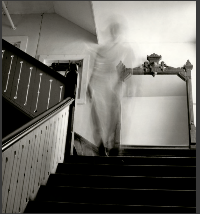
The Mirror Holds Them Not , 2010 Silver gelatin print 7.75 x 7" AS111