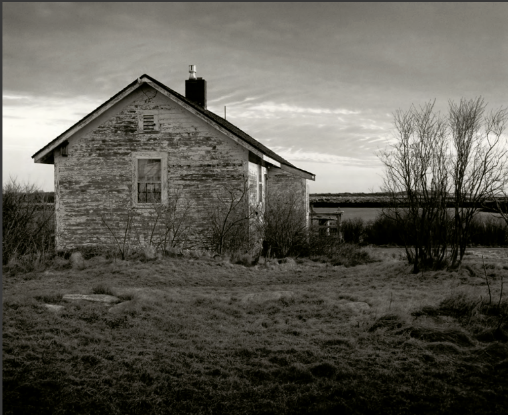
The Doctor Doesn't Live Here Anymore , 2023 Silver gelatin print 10 x 12.25" AS126