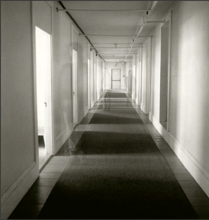
Passagers , 2023 Silver gelatin print 7.5 x 7.25" AS130