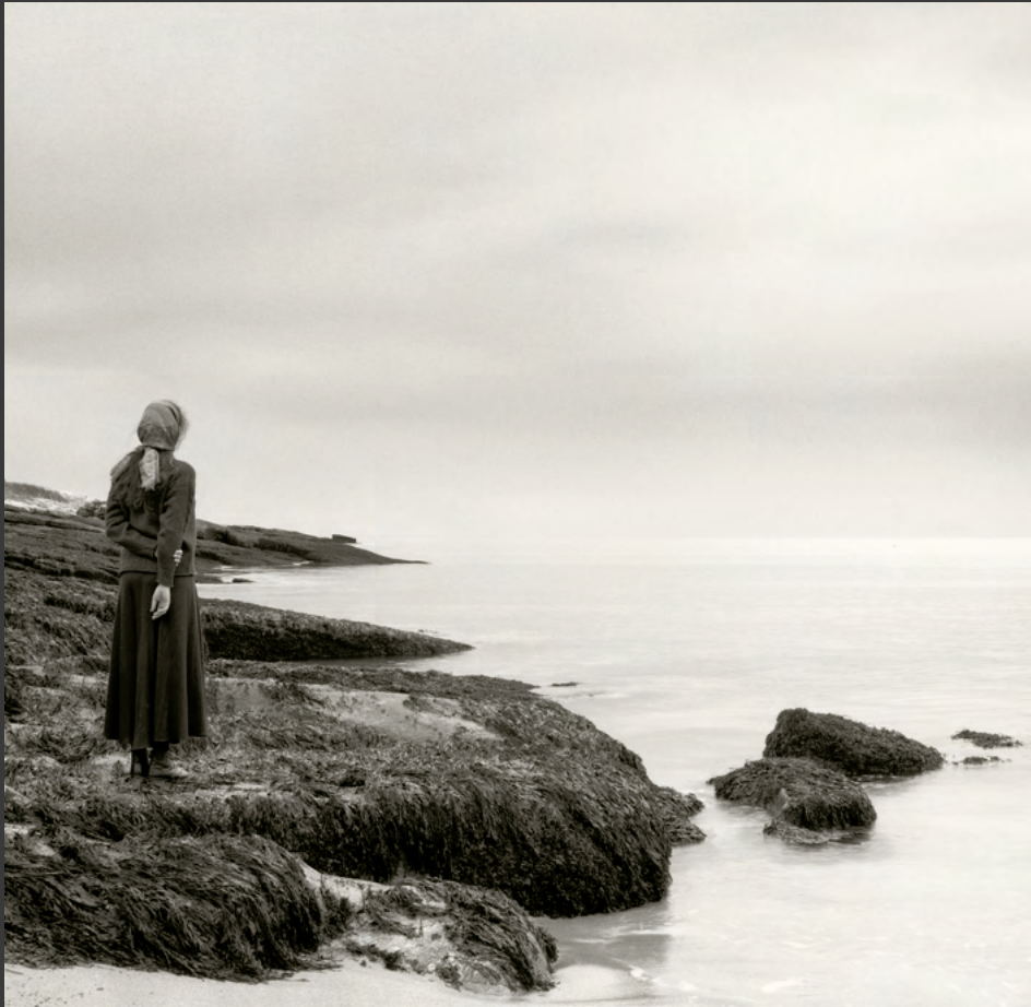
Engaging the Oceanic , 2023 Silver gelatin print 10 x 11" AS135