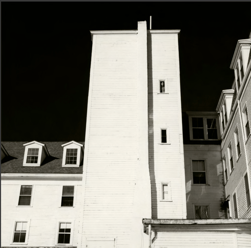
Stories: Chapter 20, 2013 Silver gelatin print 10.25 x 10.25" AS117