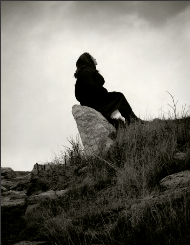
Philosopher Stone , 2023 Silver gelatin print 9.25 x 6.5" AS128