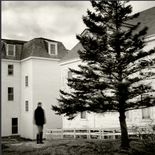
Four Story Witness, 2010 Silver gelatin print 7 x 7" AS116