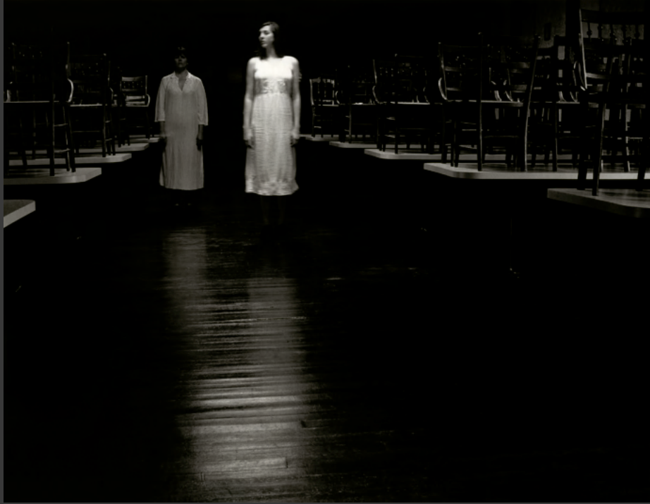
Re-Staff of Life , 2023 Silver gelatin print 7.25 x 9.25" AS129