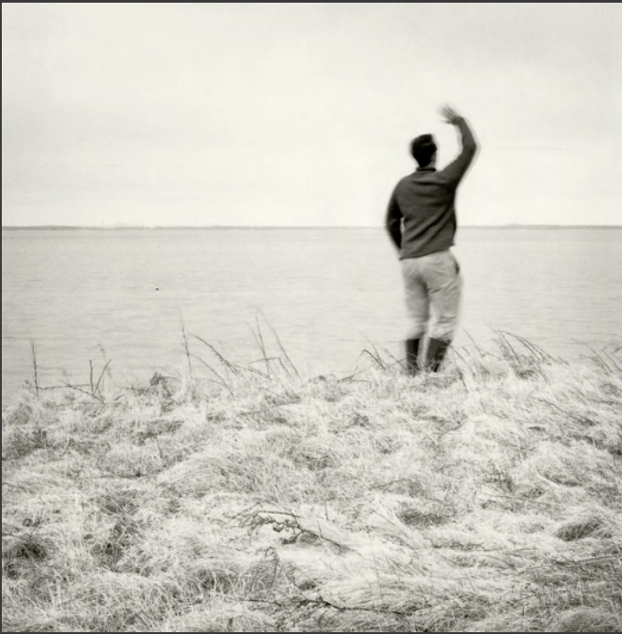
A Fundamental Thing About Islands , 2010 Silver gelatin print 7.25 x 7.25" AS112