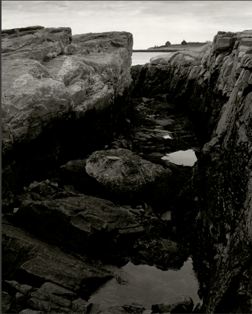
Still Life: Little Houses with Time and Tide, 2023 Silver gelatin print 12.5 x 10" AS127