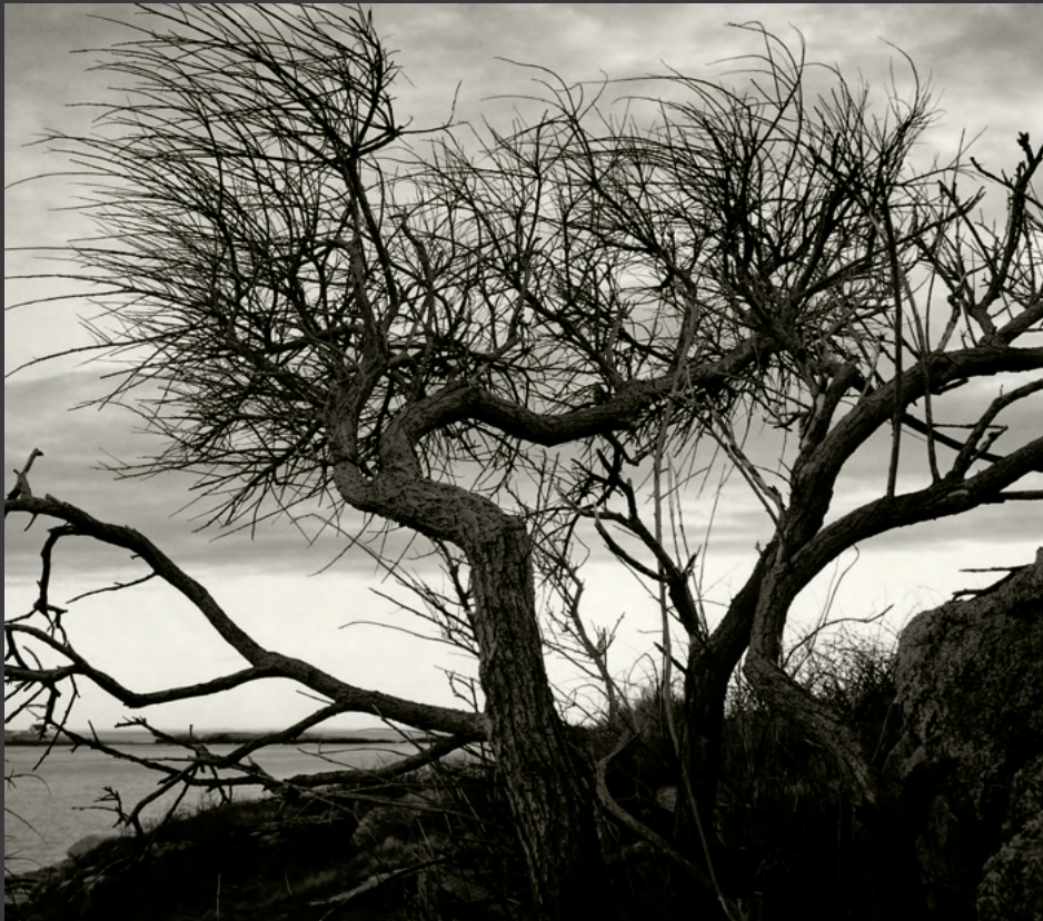
Stands Beyond the Tempest, 2023 Silver gelatin print 10 x 11.5" AS124