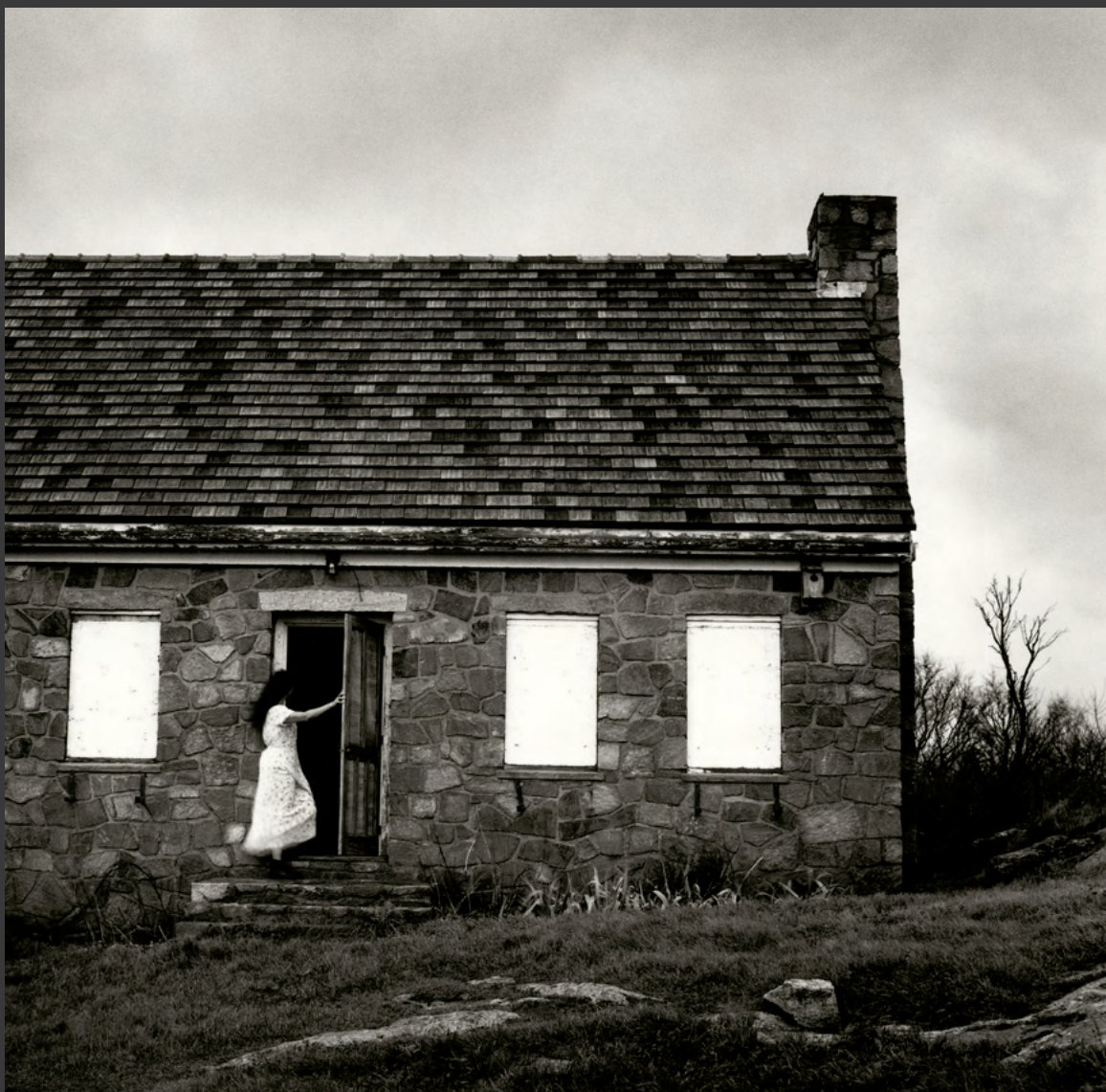
Stories: Chapter 1, 2010 Archival pigment print 20 x 20" AS142