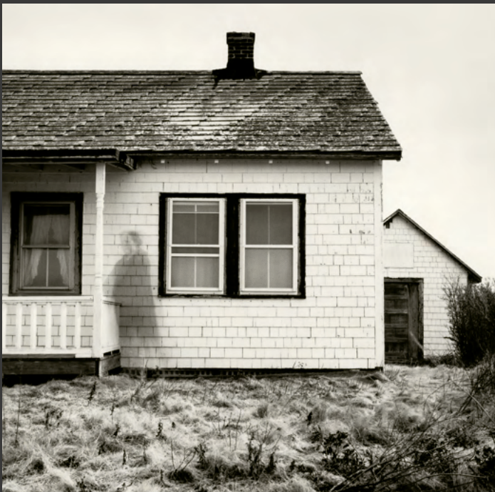
Fleeting Respite, 2023 Silver gelatin print 7 x 7.25" AS138