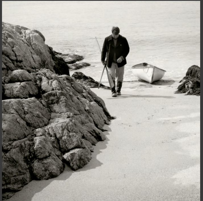
Thoughtful Before Immensity , 2023 Silver gelatin print 7 x 7.25" AS136