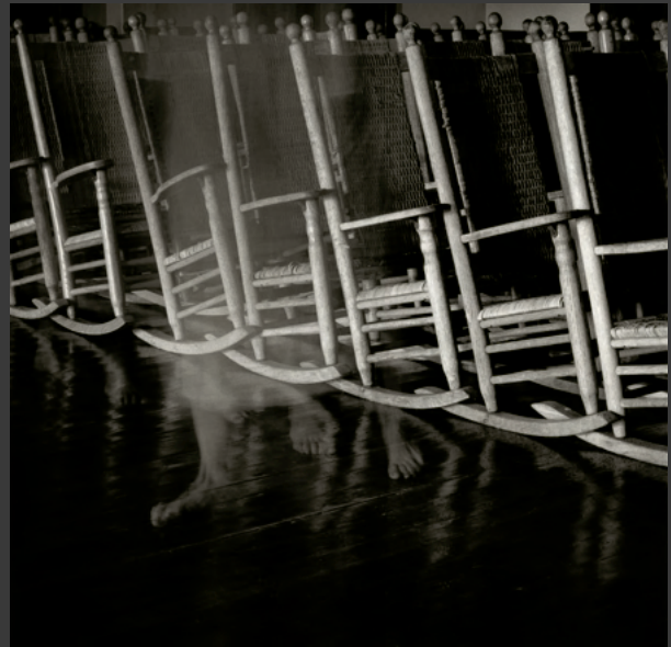
Seasonal Two-step, 2023 Silver gelatin print 7 x 7" AS132