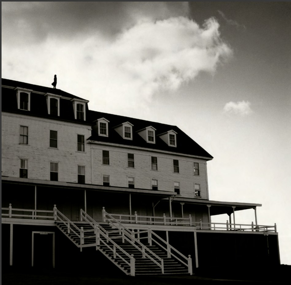
I Came to Be the Sky, 2013 Silver gelatin print 10 x 10" AS120