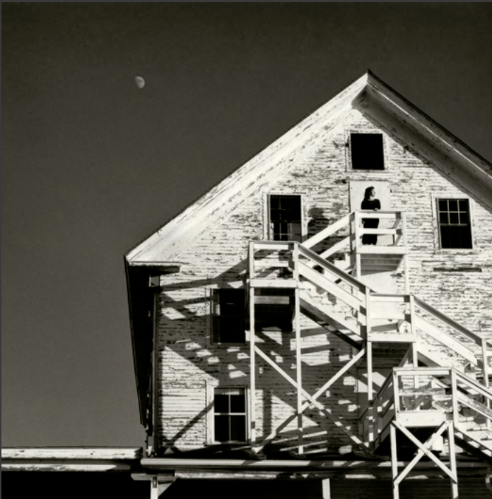
Overlook , 2023 Silver gelatin print 7 x 7.25" AS131