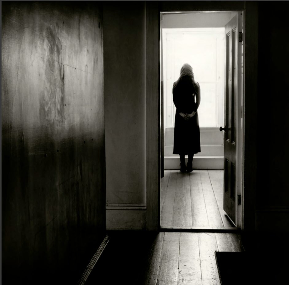
Luminous Darkness , 2011 Silver gelatin print 10.25 x 10" AS121