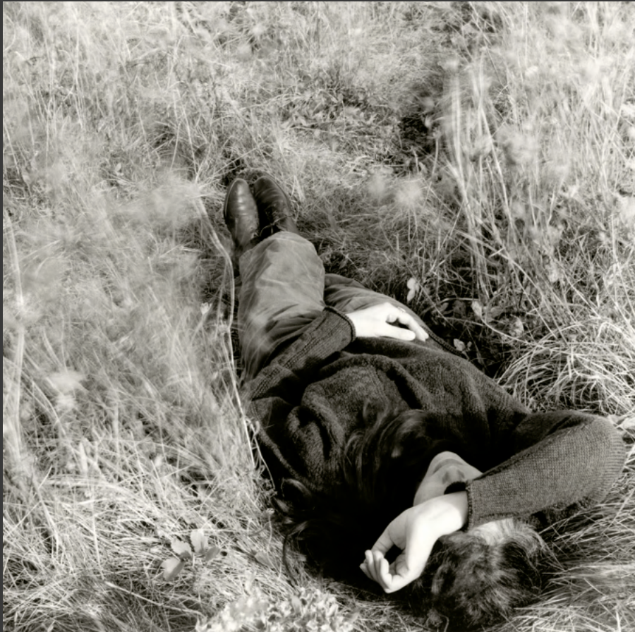
Stories: Chapter 6, 2010 Silver gelatin print 10 x 10" AS113