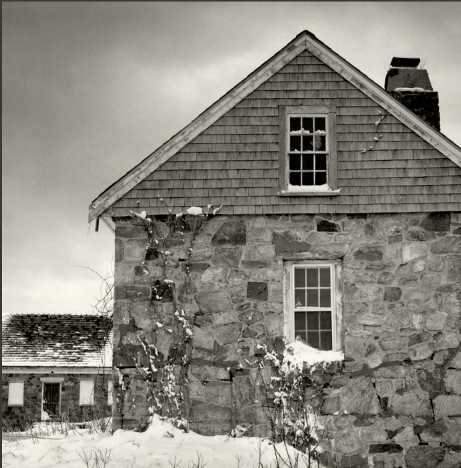
The Watcher of Winter's Deep, 2010 Silver gelatin print 10 x 10" AS115