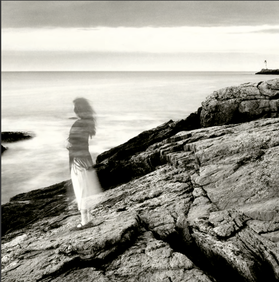
Stories: Chapter 9, 2010 Silver gelatin print 10 x 10" AS114