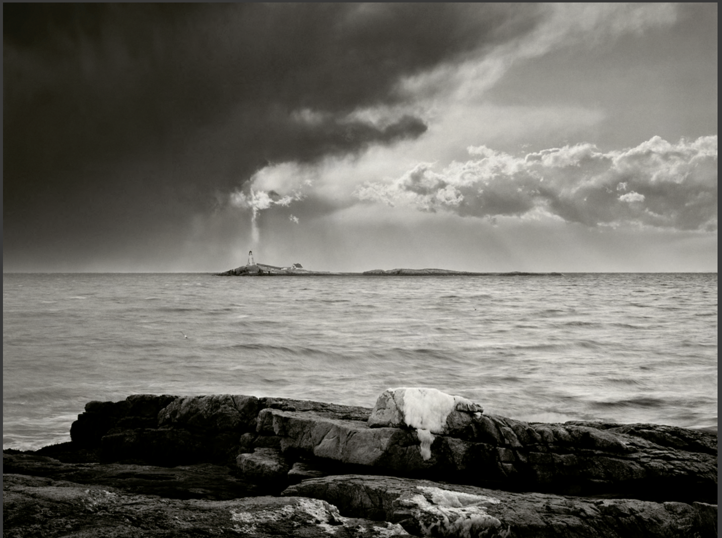
To Singe the White Head, 2024 Archival pigment print 20 x 26.5" AS144